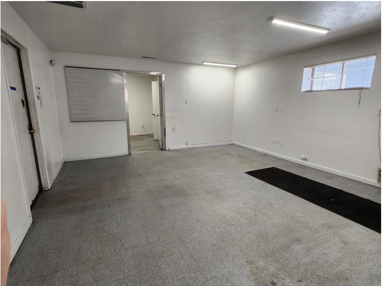
Metal building lobby or break room with attached office