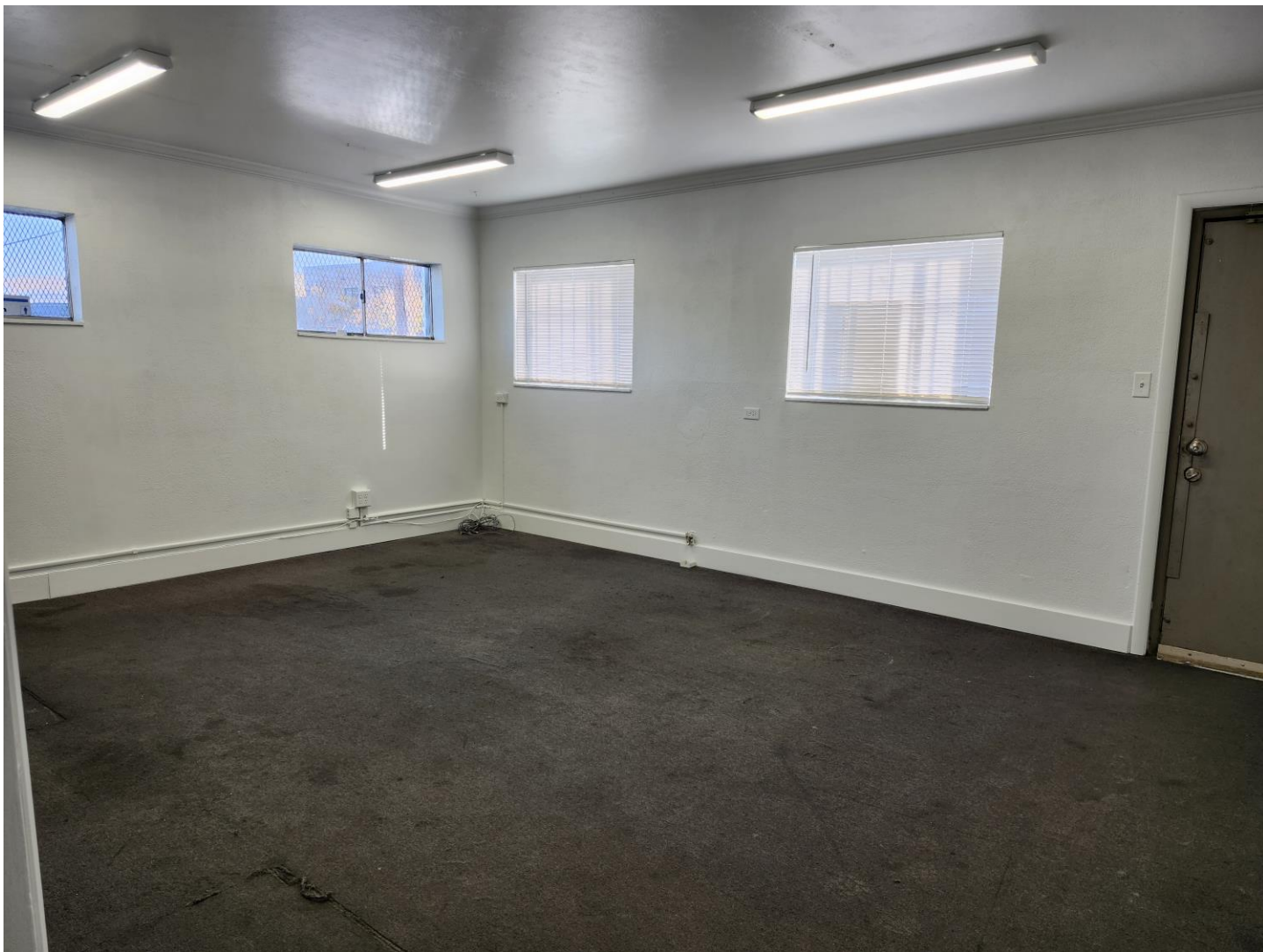
Block building lobby with attached restroom