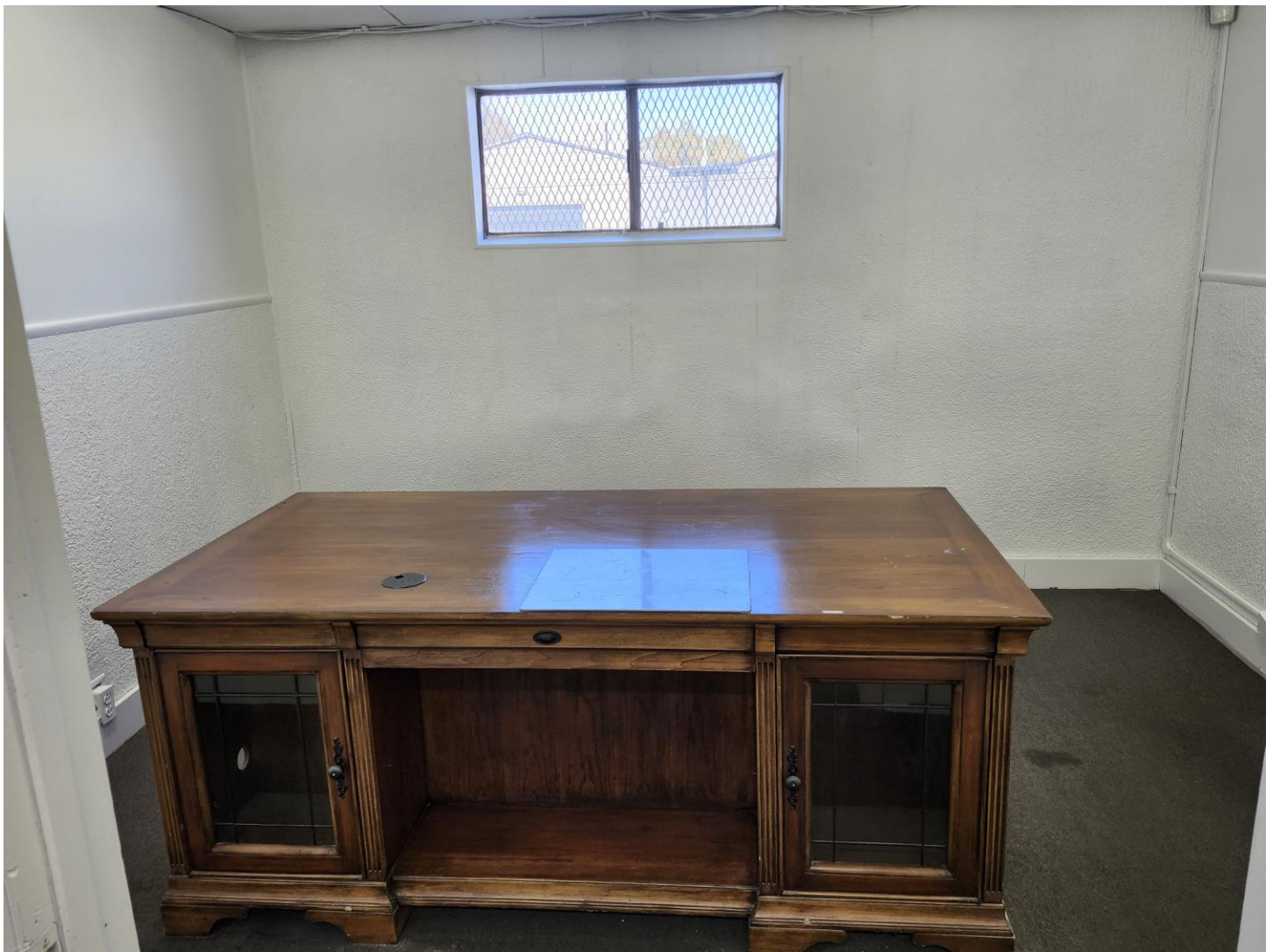
One of four offices in block building