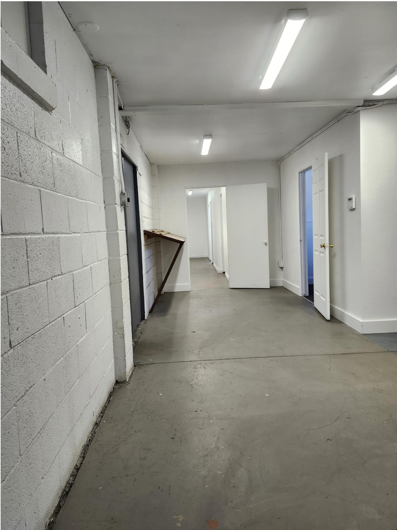
Hallway to four offices in block building and additional restroom