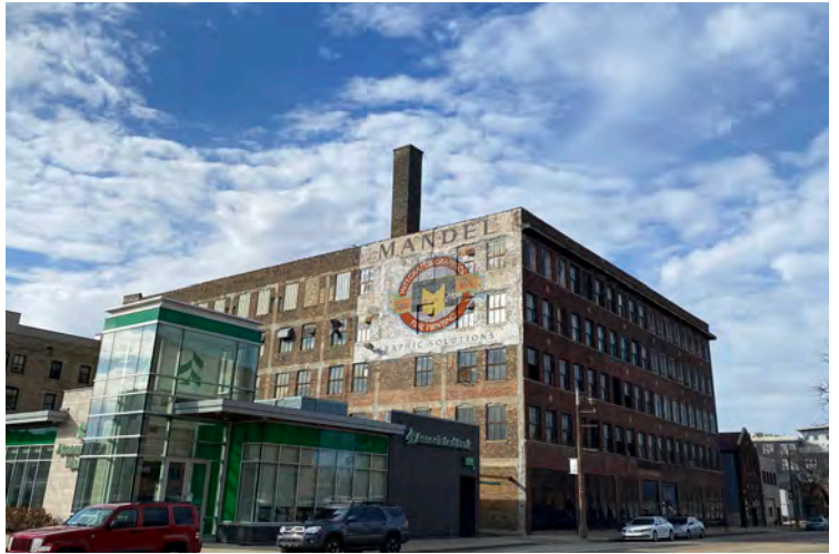
View of building from entrance to Fiserv Forum

The listing also includes a parking lot with 30 stalls one block away.