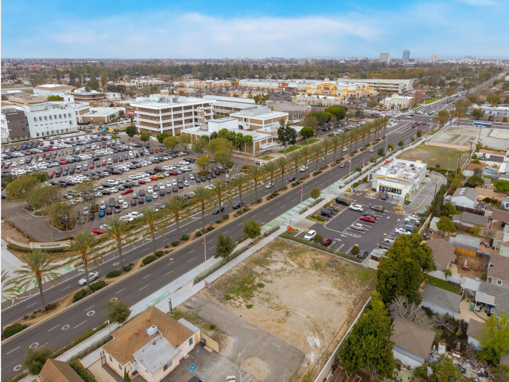
1421 N Bristol St MLS-10