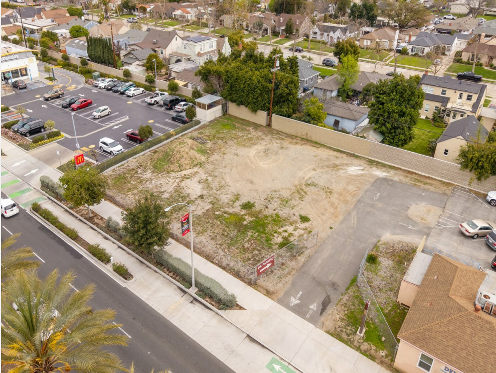
1421 N Bristol St MLS-12