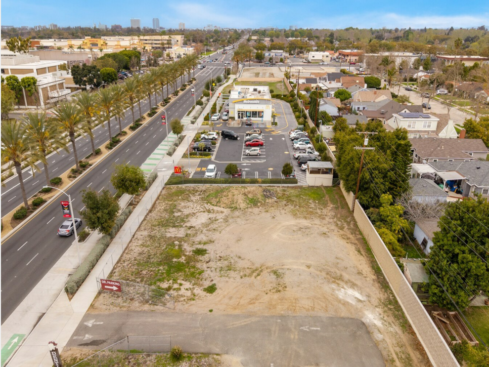
1421 N Bristol St MLS-5