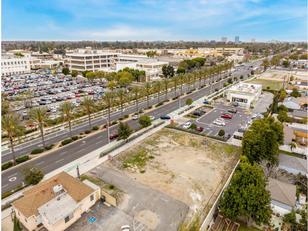
1421 N Bristol St MLS-2