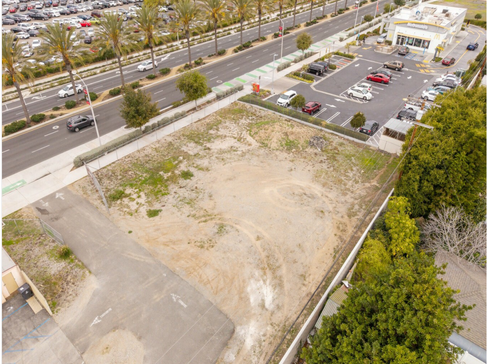
1421 N Bristol St MLS-3