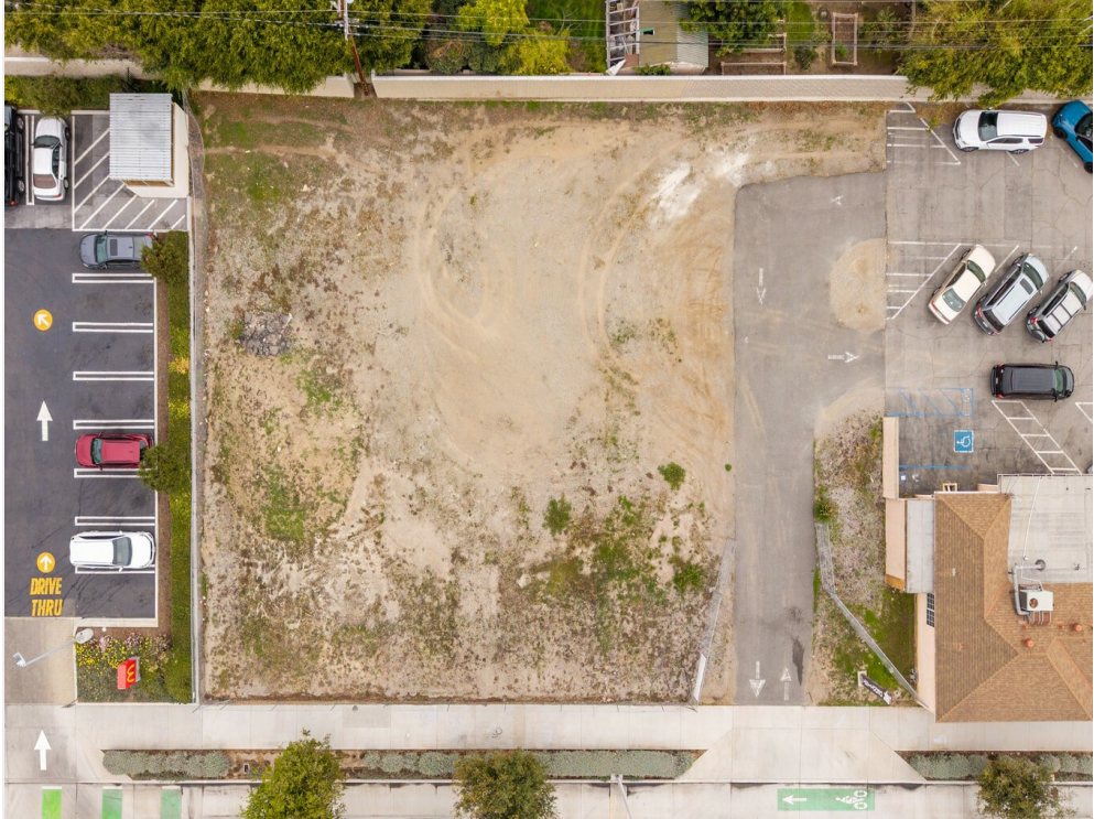
1421 N Bristol St MLS-8