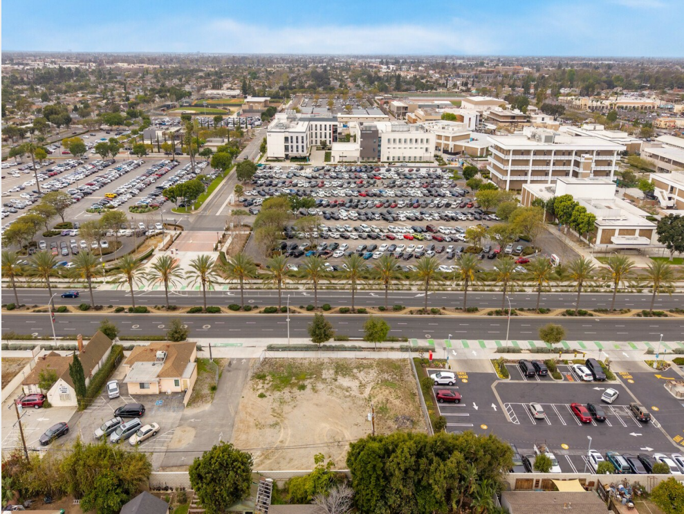
1421 N Bristol St MLS-9