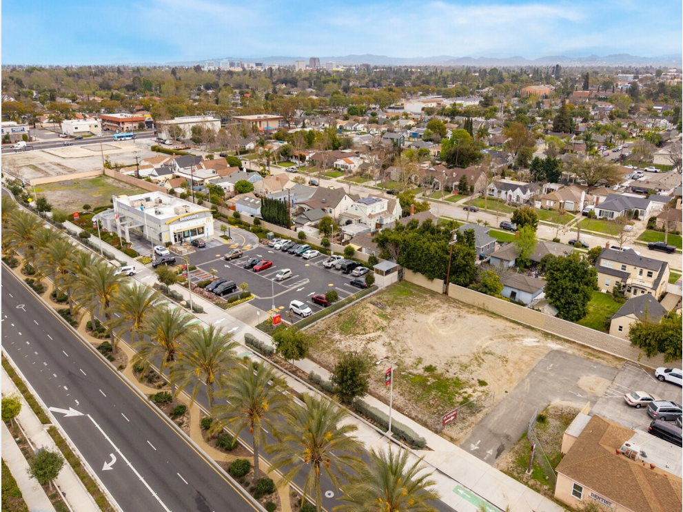
1421 N Bristol St MLS-11