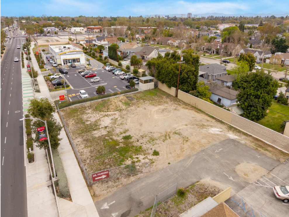
1421 N Bristol St MLS-4