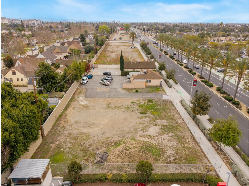
1417 N Bristol St MLS-6