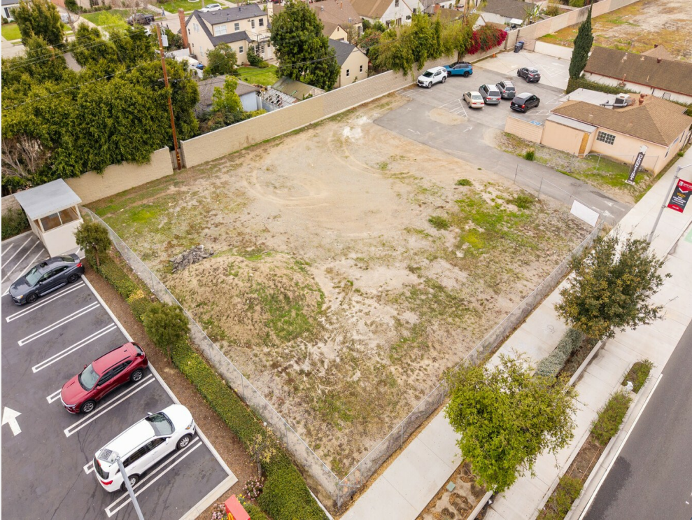
1421 N Bristol St MLS-7