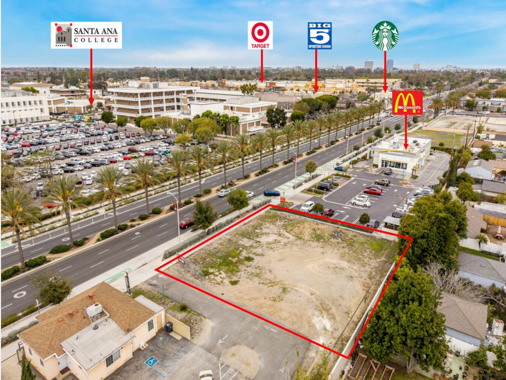
1421 N Bristol St MLS-1