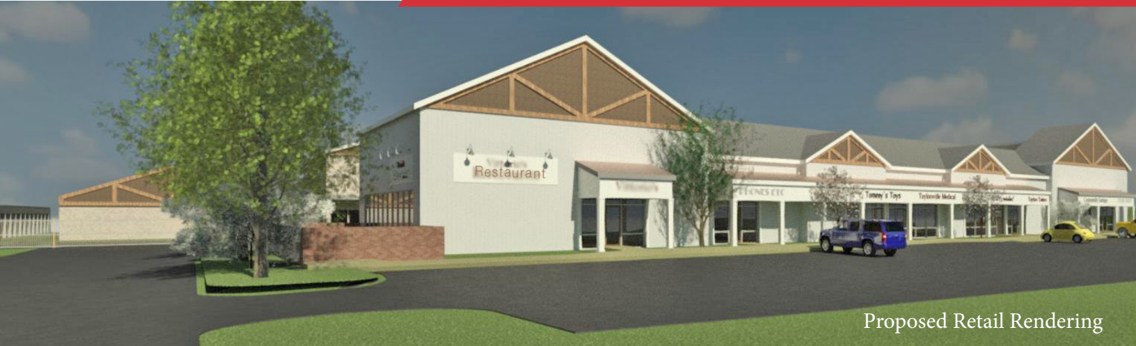
Proposed Retail Rendering