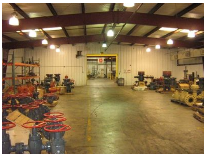
Stagecoach Rd. Build A Interior