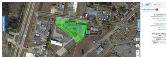
3245 Stage Coach Building A Aerial