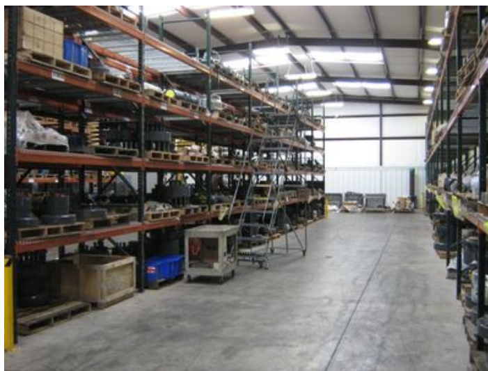
Stagecoach Rd. Building A Racks