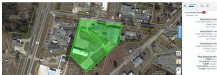
3225 Stagecoach Aerial