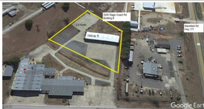
3245 Stage Coach Rd Building B Aerial