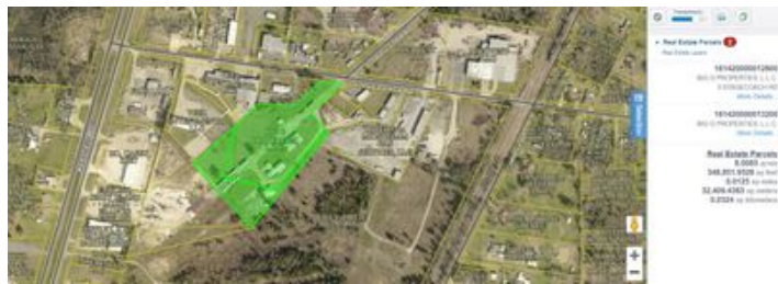
Adjacent 10 Acres for Sale