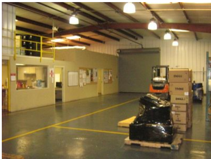
Stagecoach Rd. Building B Warehouse