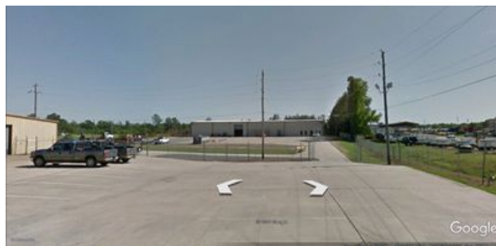
3245 Stage Coach Rd Building B Approach