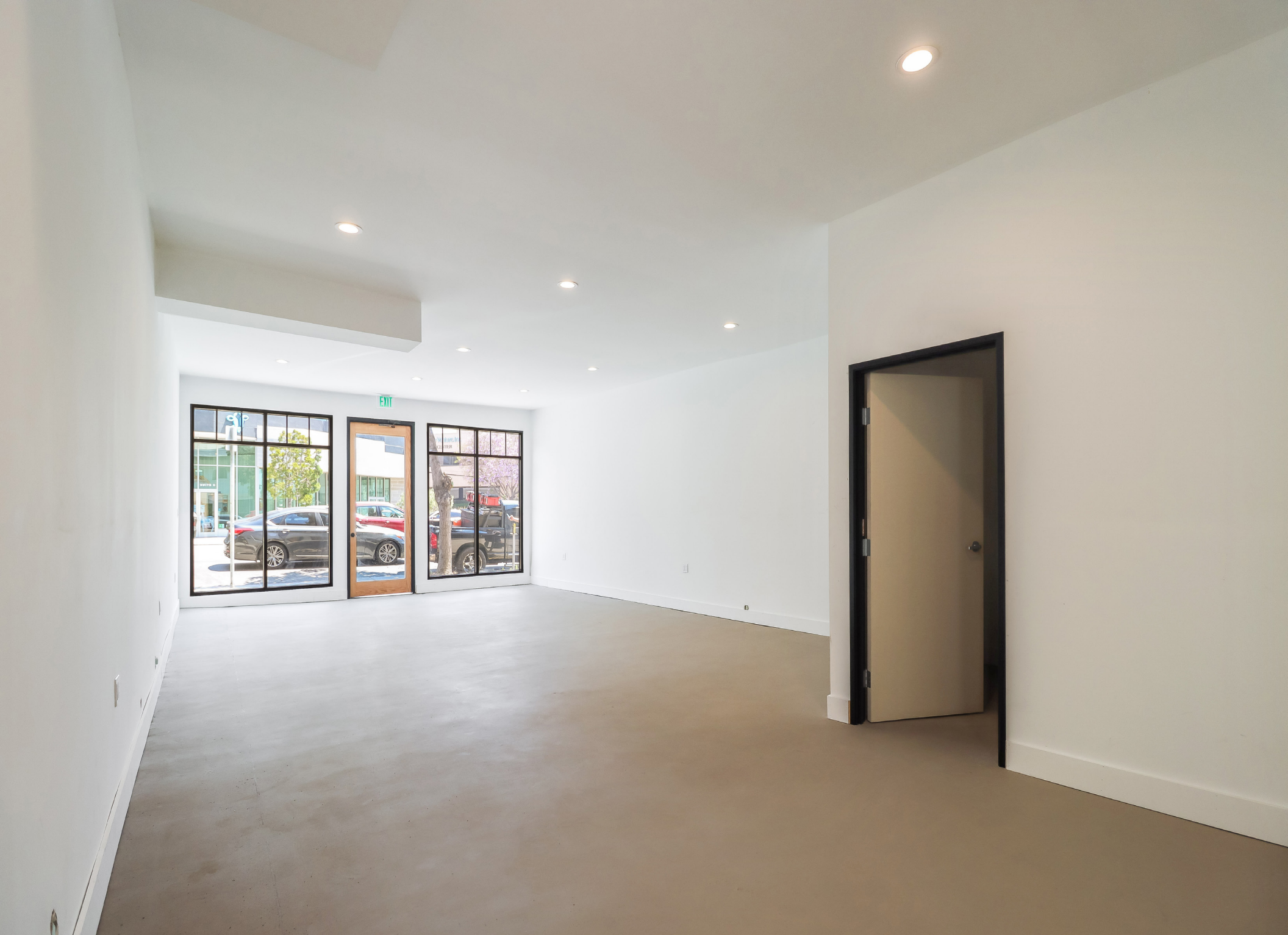
4516 Hollywood - 867 SF