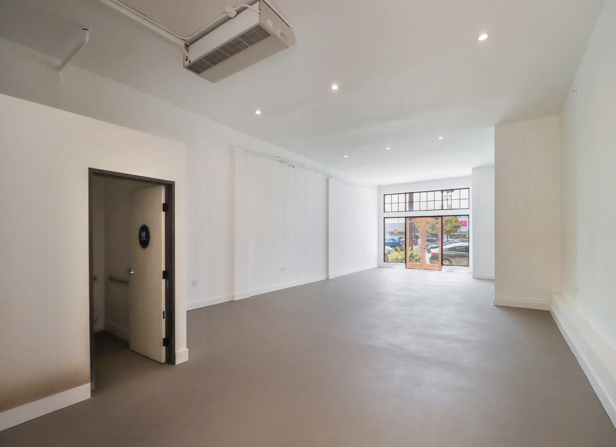
4511 Sunset Blvd - 939 SF, 4517 Sunset Blvd - 1,066 SF, 4519 Sunset Blvd - 1,264 SF