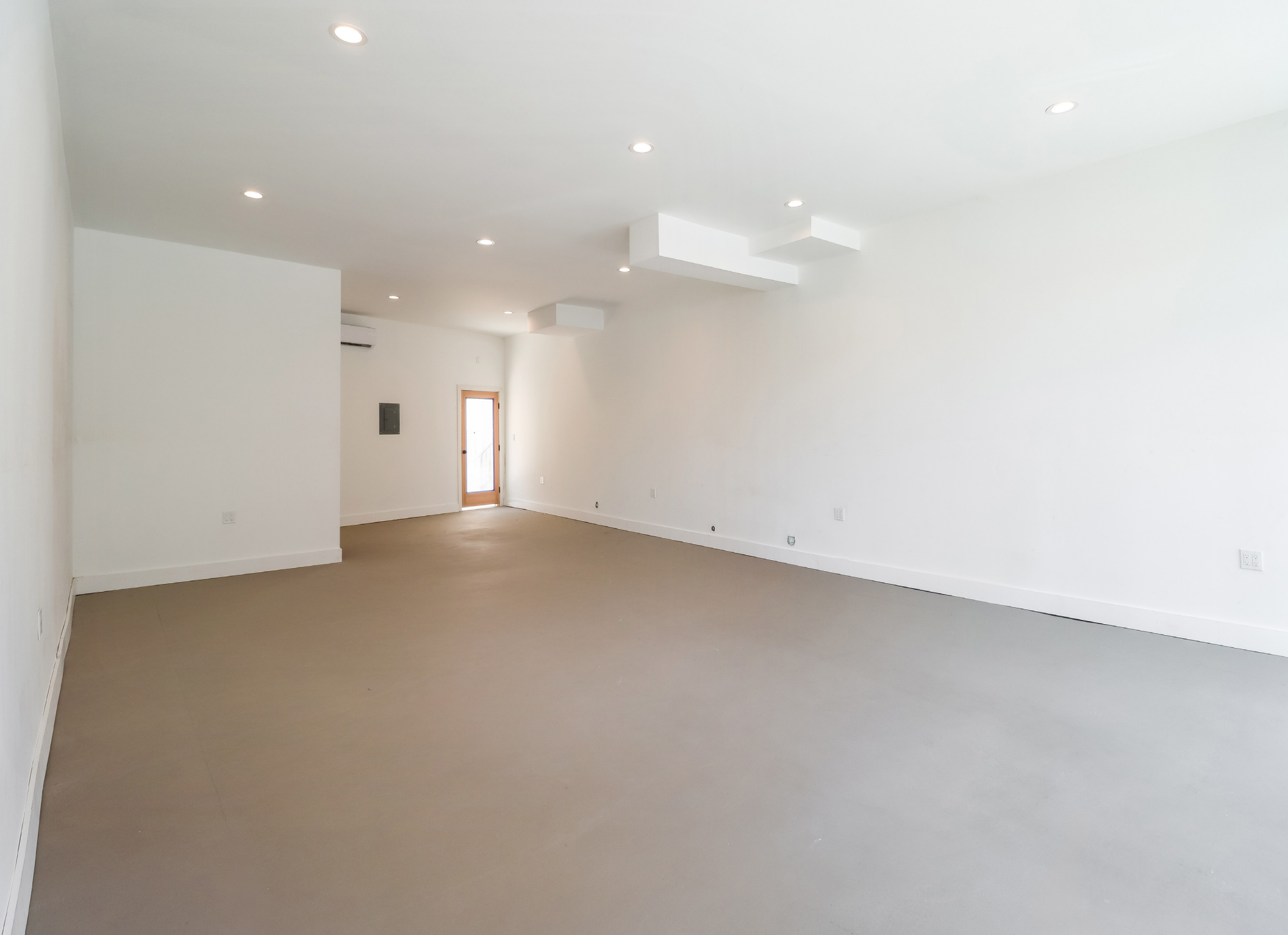
4516 Hollywood - 867 SF