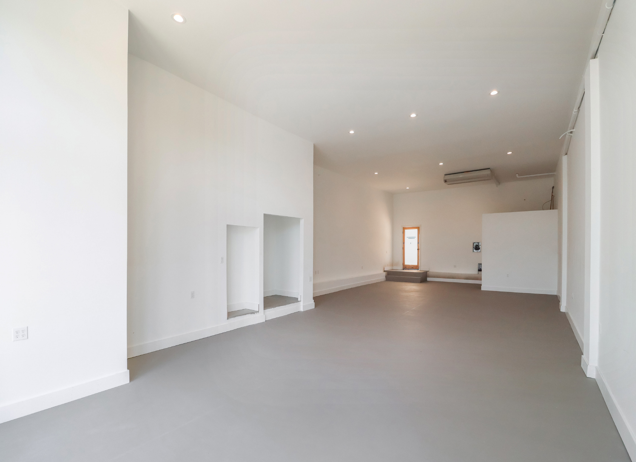
4511 Sunset Blvd - 939 SF, 4517 Sunset Blvd - 1,066 SF, 4519 Sunset Blvd - 1,264 SF