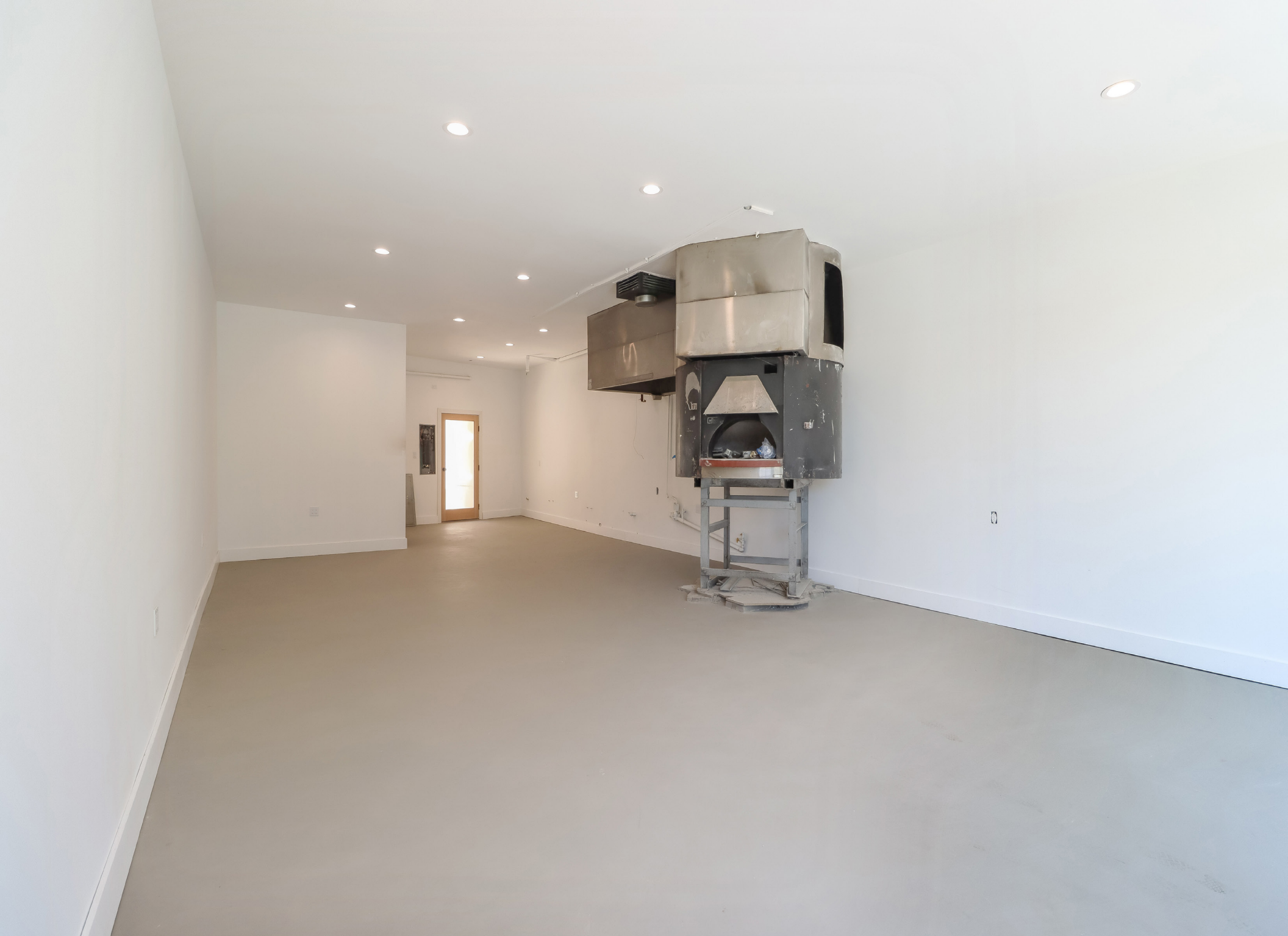
4518 Hollywood - 917 SF