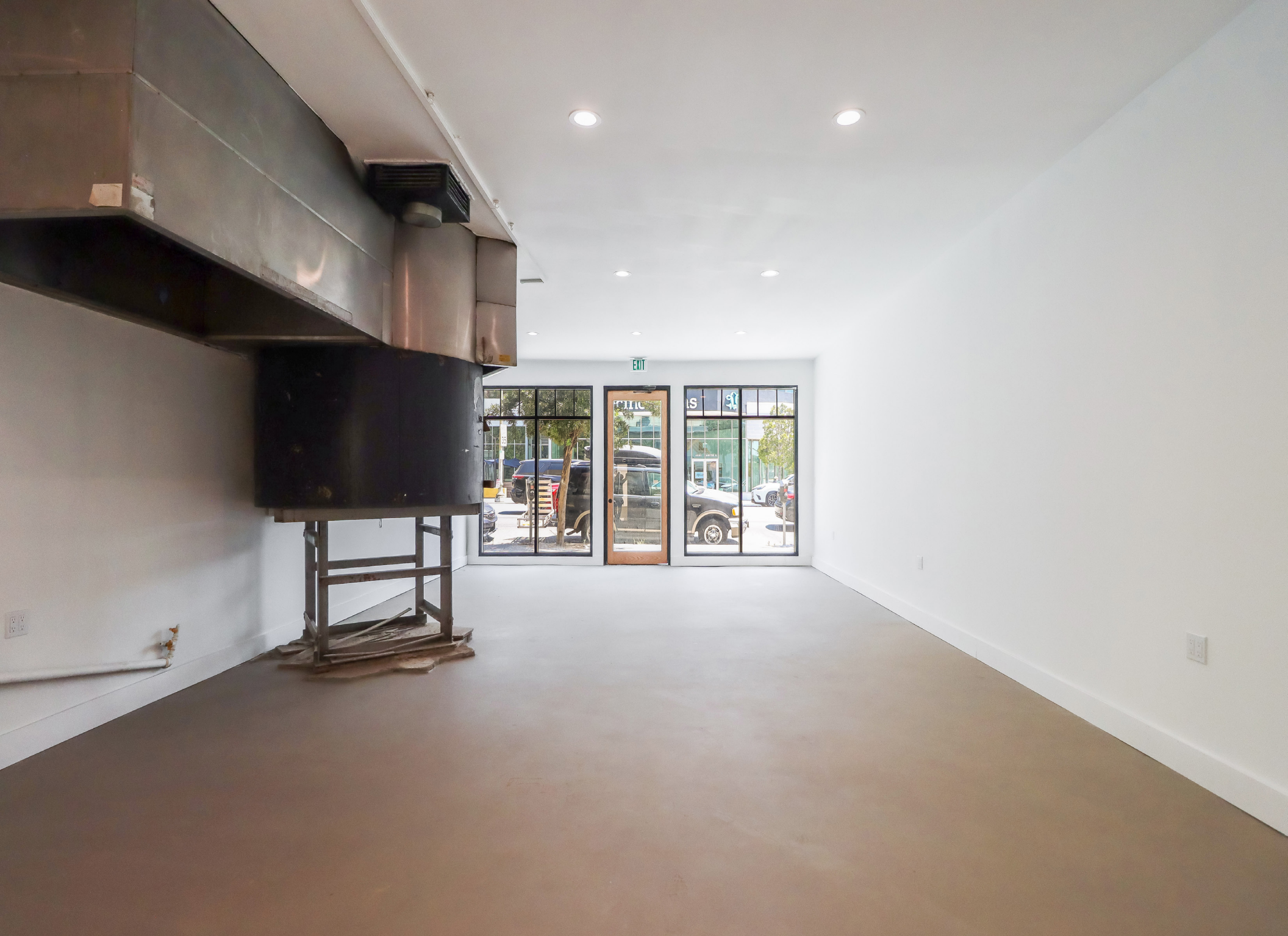
4518 Hollywood - 917 SF