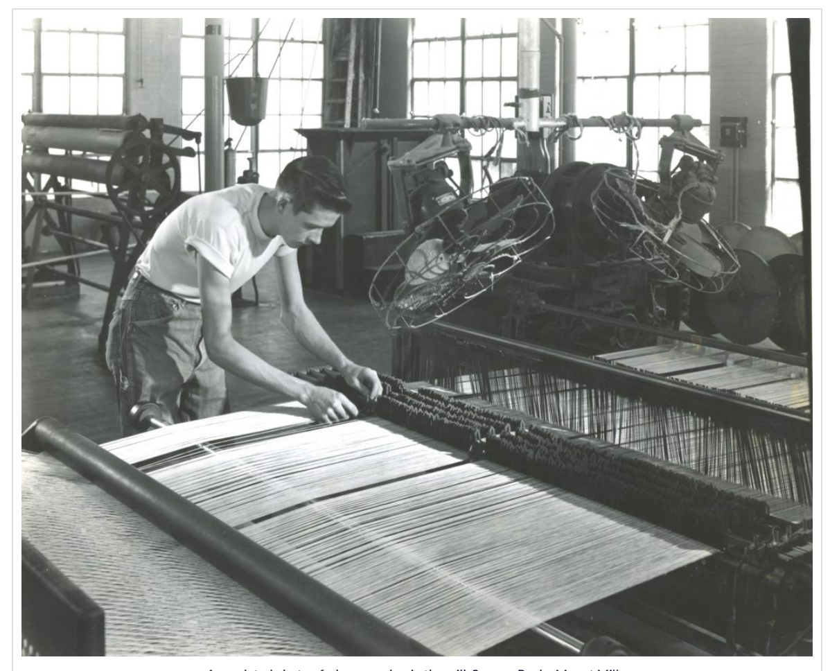
An undated photo of a loom worker in the mill.