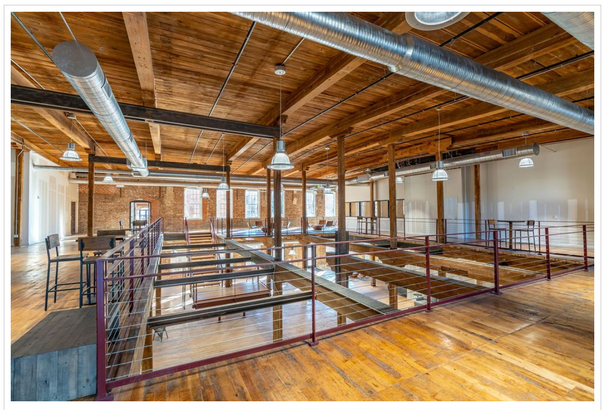
Communal space inside the restored main building of Rocky Mount Mills.

It's the largest overhaul yet for this 150-acre mixed-use development spearheaded by Capitol Broadcasting Company (CBC), the parent company of WRAL TechWire.