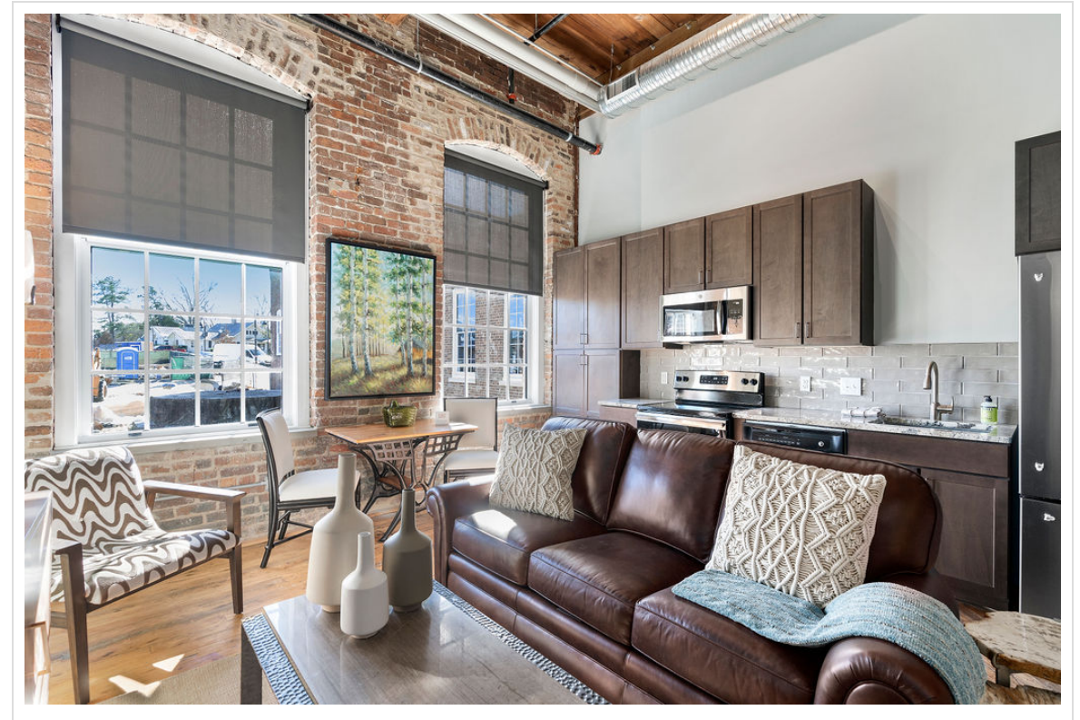
Inside one of Rocky Mount Mills' newly refurbished apartments.