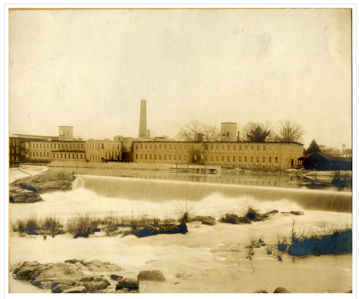
Another undated photo of the mill with the view of the waterfalls.