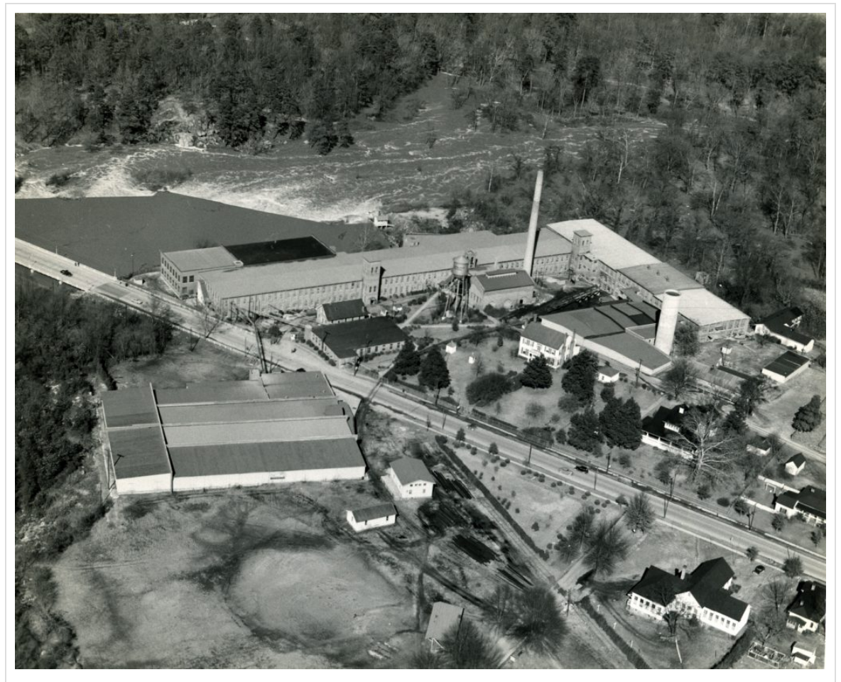
An old aerial shot of the mill.