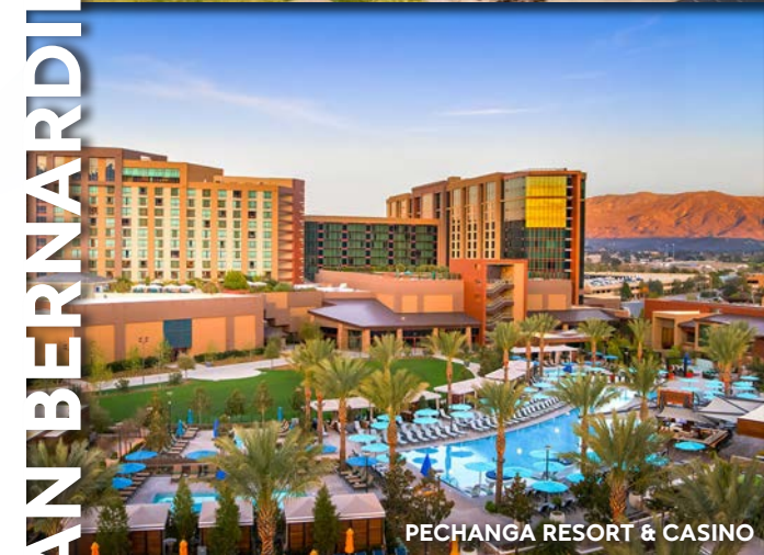
PECHANGA RESORT & CASINO