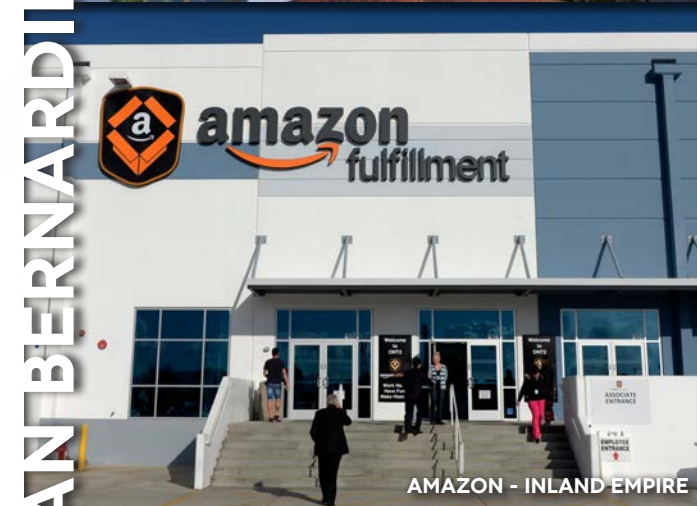
AMAZON - INLAND EMPIRE