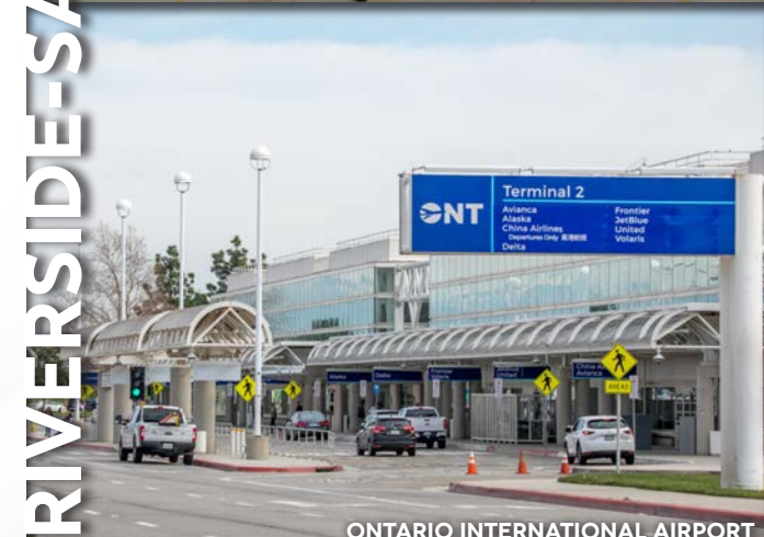
ONTARIO INTERNATIONAL AIRPORT