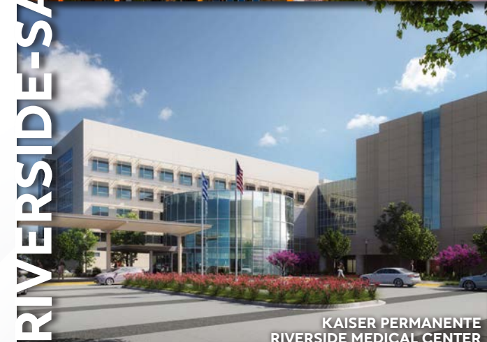
KAISER PERMANENTE RIVERSIDE MEDICAL CENTER