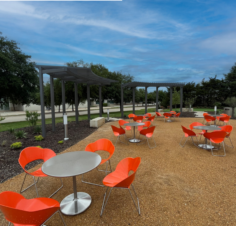
OUTDOOR SEATING AND TRELLIS