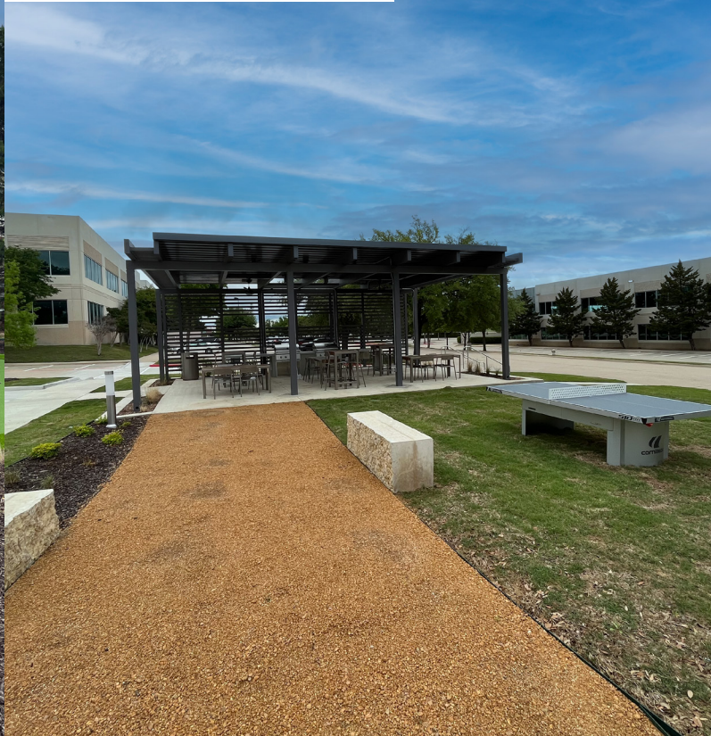
OUTDOOR KITCHEN WITH PING PONG