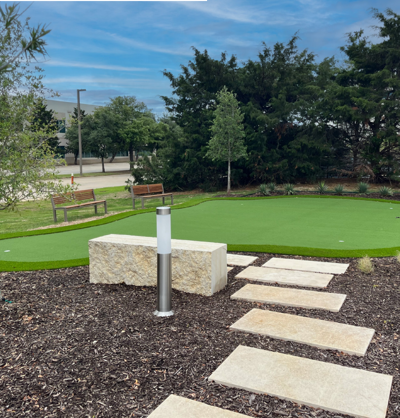
PUTTING GREEN AND SEATING