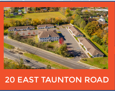
20 EAST TAUNTON ROAD