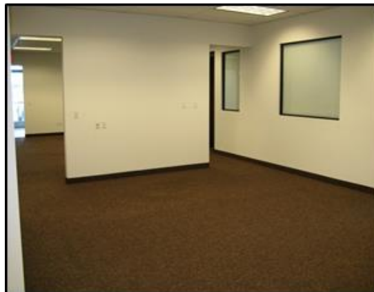
Suite A - ±3,000 sf Office Space

Address: 8945 W Russell Rd Suite 207 Las Vegas, Nevada 89148