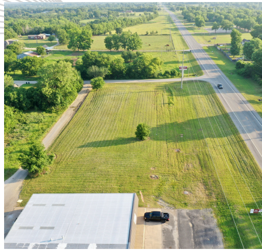
Completion Q4 of 2024