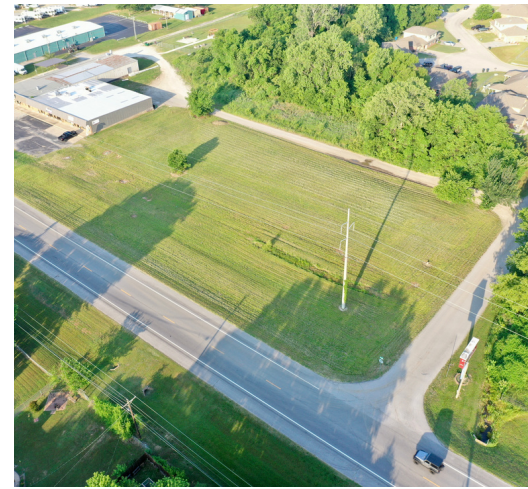
1/2 Mile from RSU College