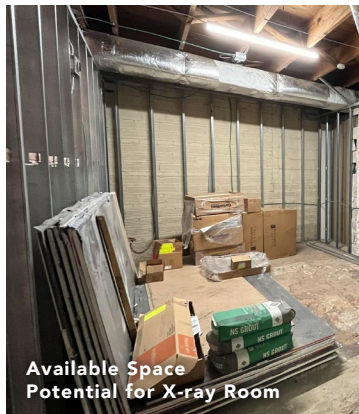
Available Space Potential for X-ray Room