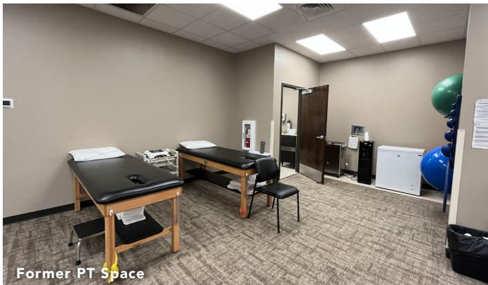
Former PT Space