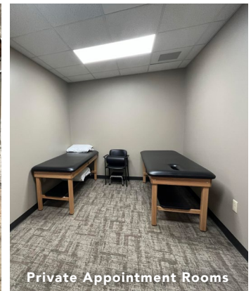
Private Appointment Rooms