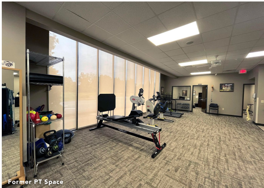
Former PT Space

Medical office space available along main Talladega corridor