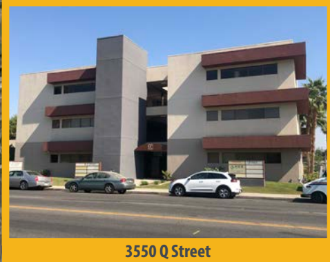
3550 Q Street