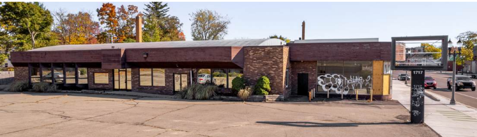
1717 E. Michigan Ave. (West Facade)