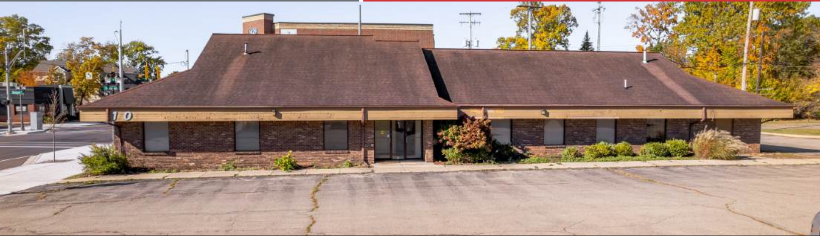
1703 E. Michigan Ave. (East Facade)