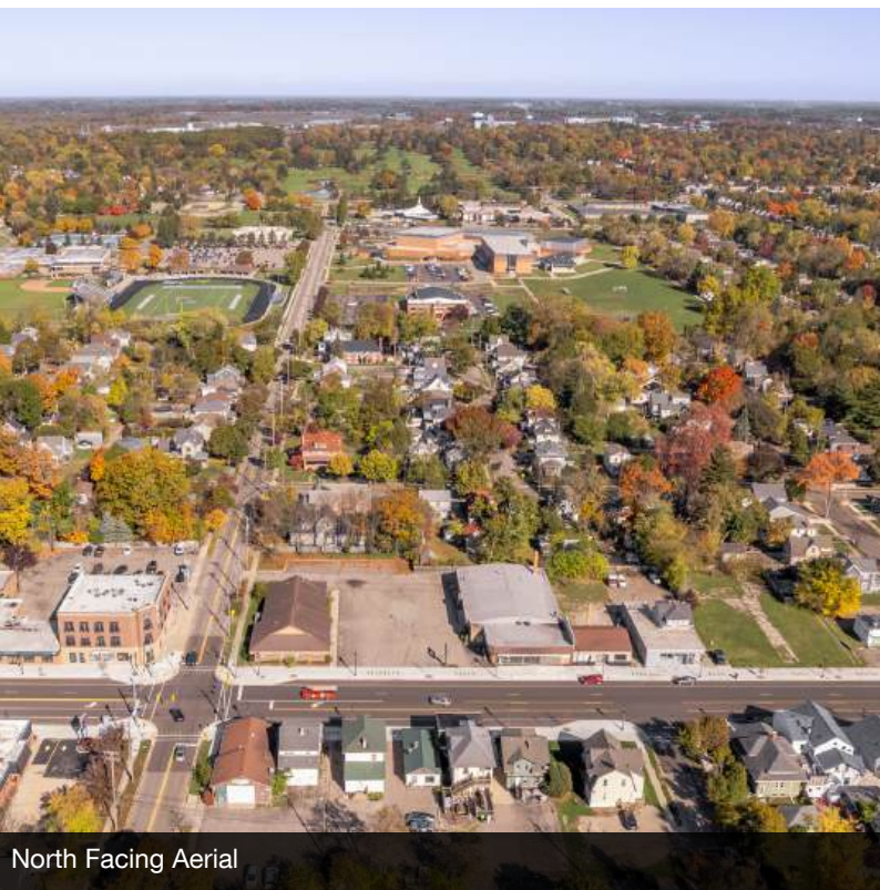
North Facing Aerial