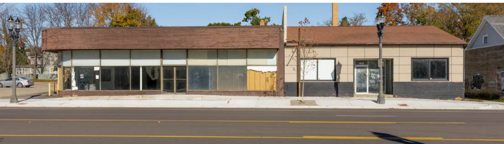
1717 E. Michigan Ave. (South Facade)