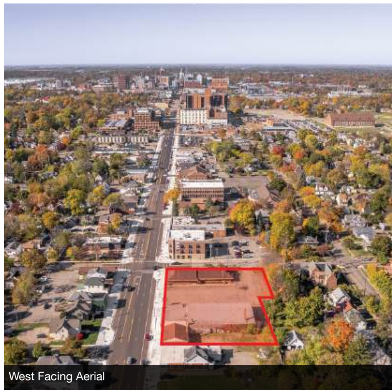
West Facing Aerial