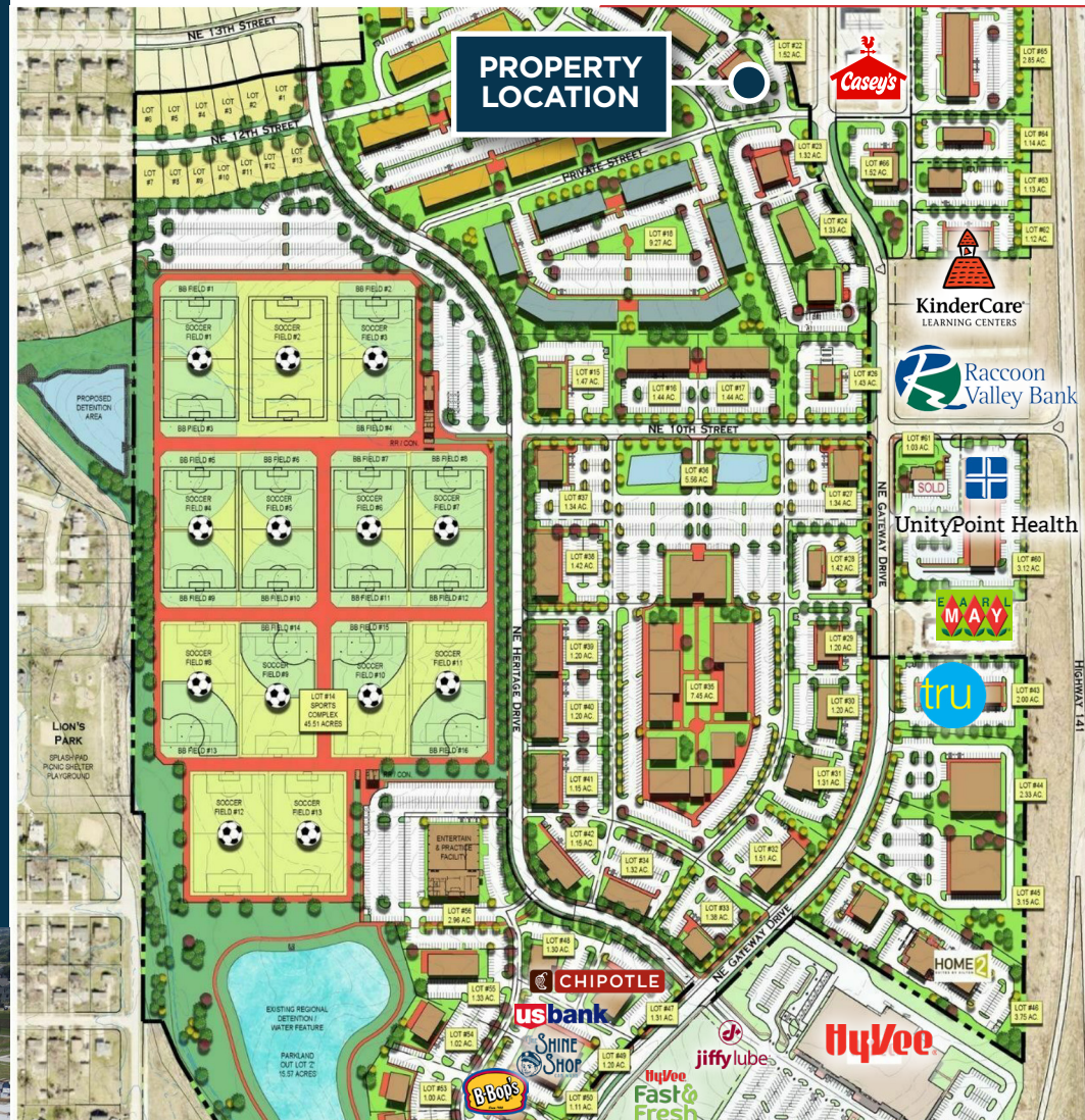
This image shows the design of Grimes' Hope District with areas labeled 2 and 3 being designed for development of a town center with plans for restaurants, retail, entertainment and office. Image provided by the city of Grimes.