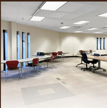
Flex Coworking Space Starting at $50 p/month

The Solarium is a unique blend of work and wellness nestled in the heart of Waterloo, Wisconsin. Whether you're a solo entrepreneur, a remote worker, or a growing team, we offer modern office solutions designed for focus, collaboration, and creativity—with the natural beauty of Wisconsin all around you. Choose from a variety of office setups tailored to your workflow. Enjoy high-speed fiber internet, comfortable workspaces, and a professional atmosphere.