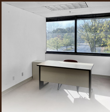
Private Offices Starting at $300 p/month