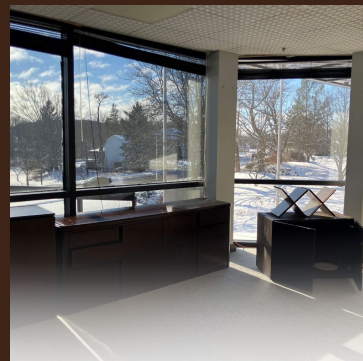
Office Suites Starting at $1500 p/month