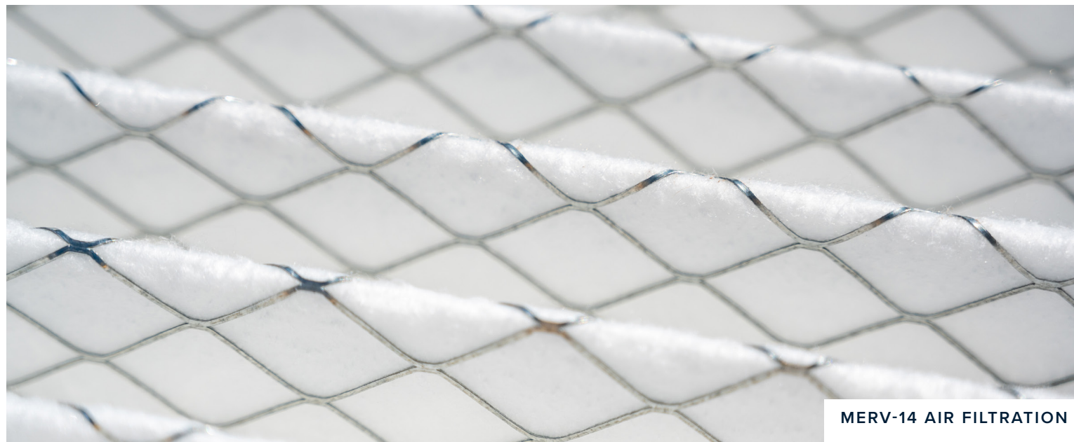
MERV-14 AIR FILTRATION