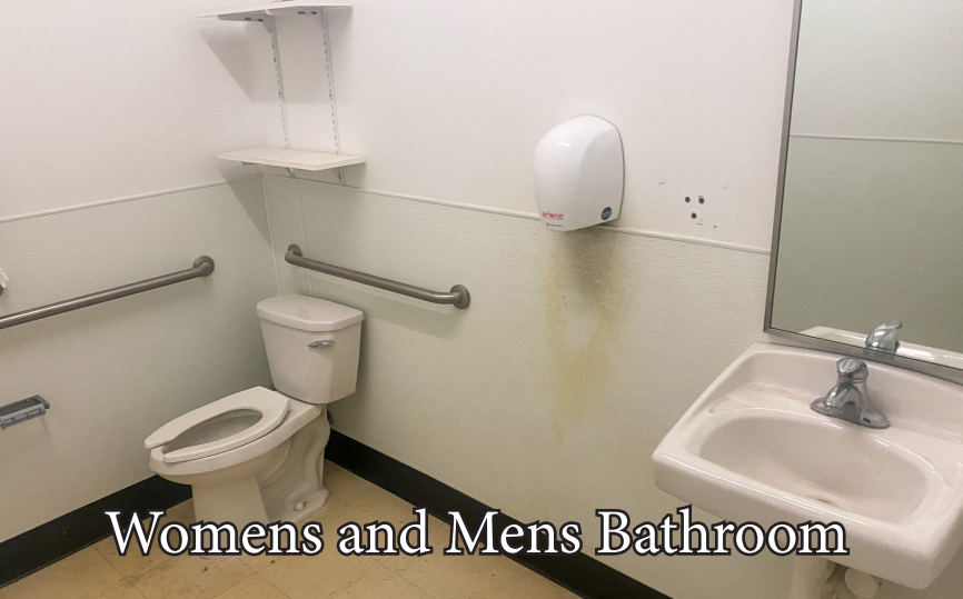
Womens and Mens Bathroom