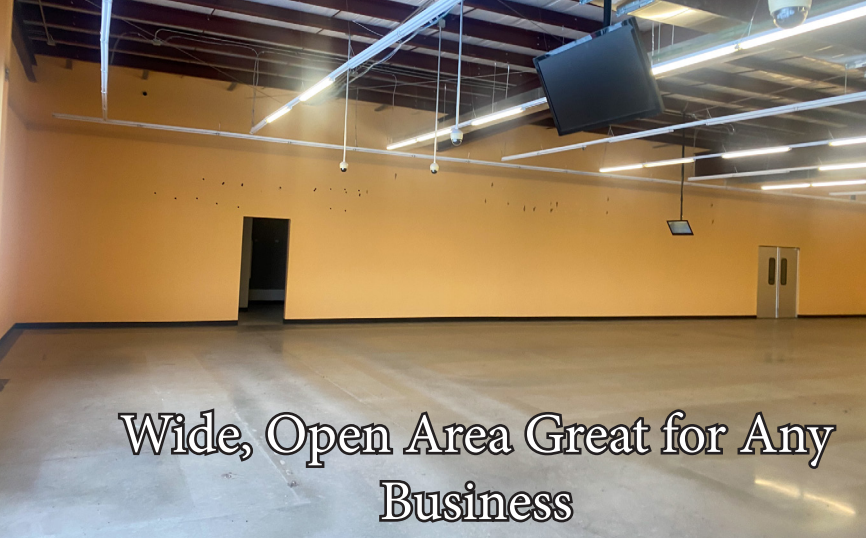
Wide, Open Area Great for Any Business