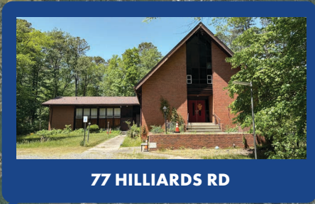
77 HILLIARDS RD