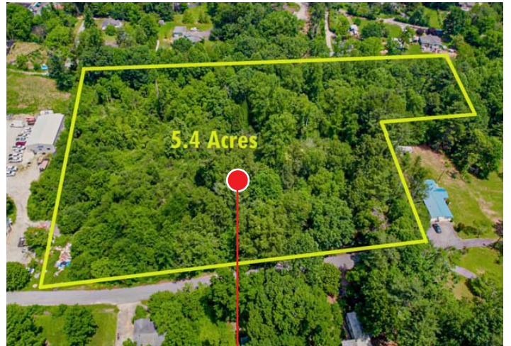
MAP CREDIT: NOAA

Ingles, Pardee Health & First Citizens Bank nearby