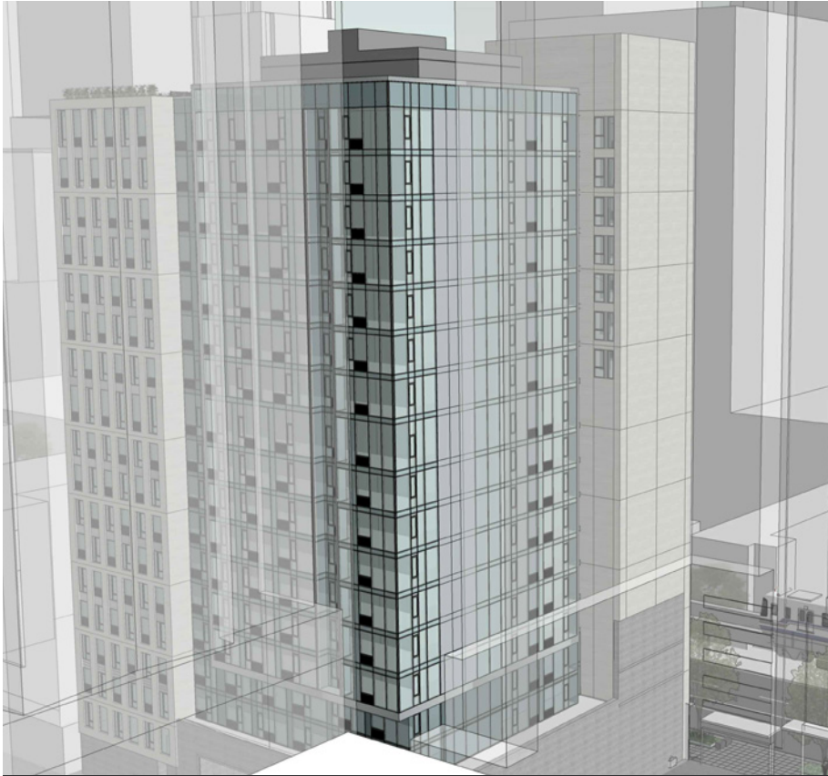
170 Entitled Project