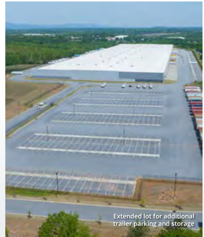
Extended lot for additional trailer parking and storage

An industrial user at this location will benefit from a central location with an established workforce for manufacturing, assembly or distribution. The surrounding corridor consists of many large industrial users including BMW, Swift, Plastic Omnium, Pilot and many more.