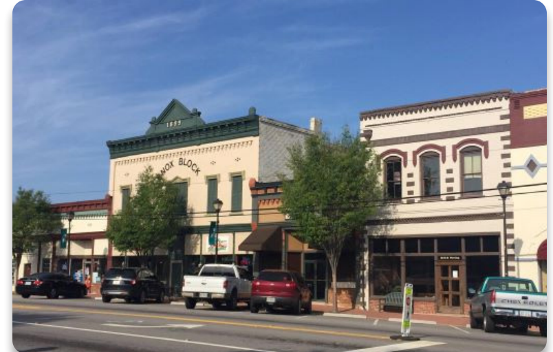
Downtown Social Circle, GA 4.9 miles away