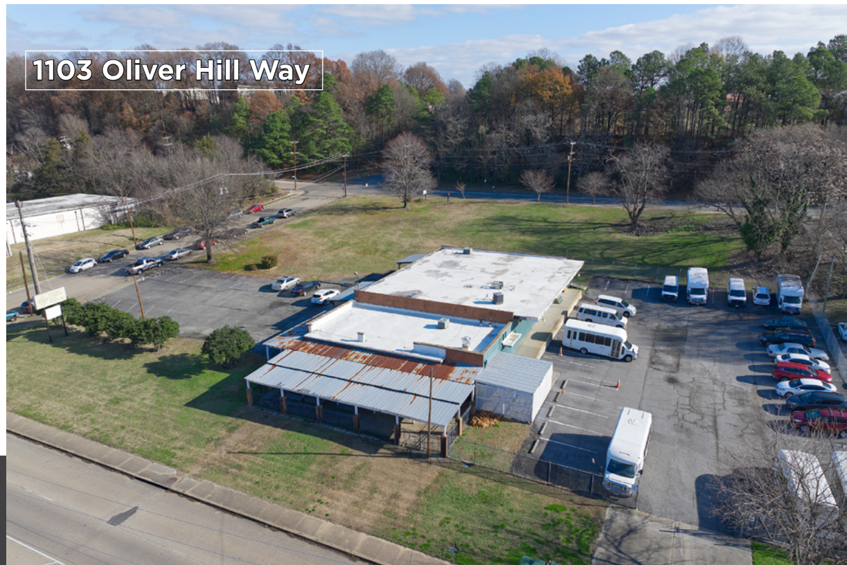
1103 Oliver Hill Way