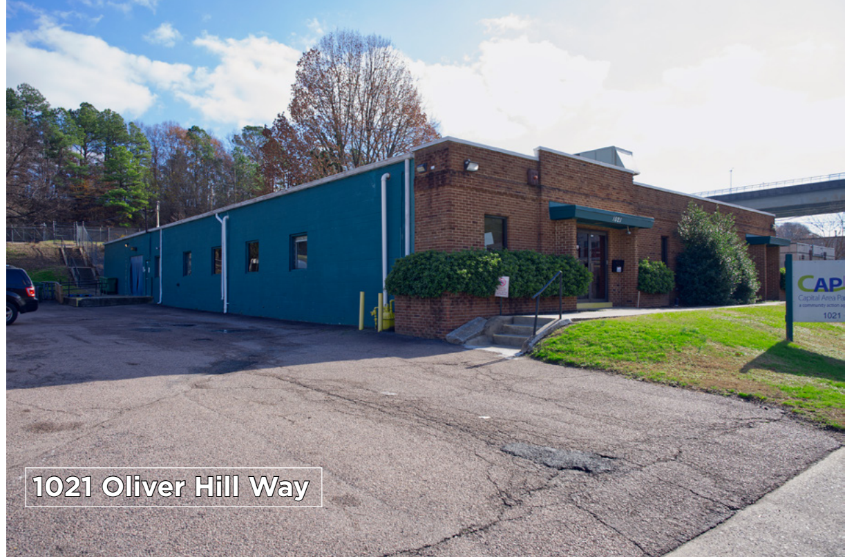
1021 Oliver Hill Way

804-346-4966 | commonwealthcommercial.com