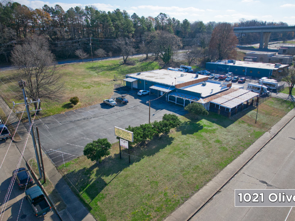
1021 Oliver Hill Way