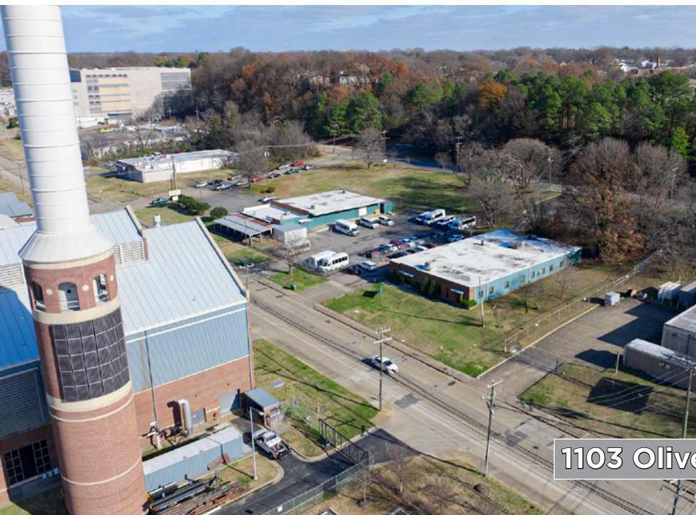
1103 Oliver Hill Way