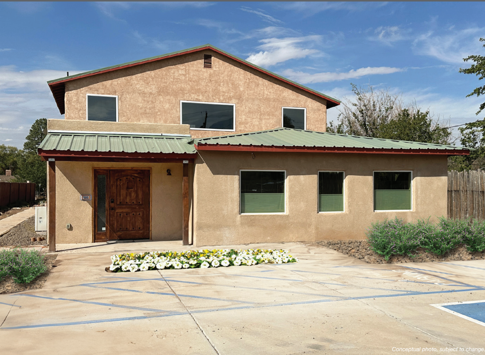
Conceptual photo, subject to change.