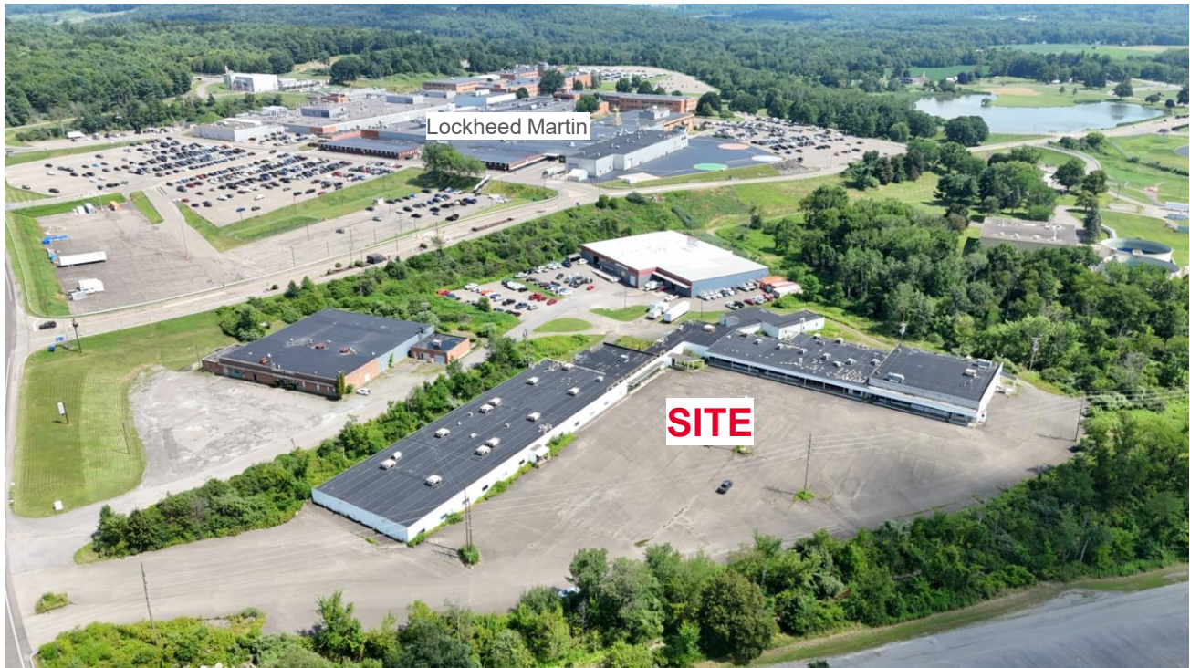
Lockheed Martin, Owego employs approximately 2,500 people