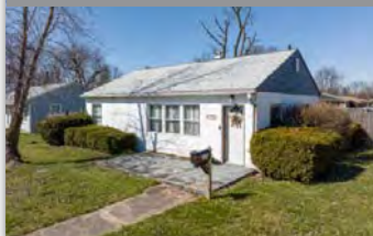
1808 E Hanna Ave, Indianapolis, IN

816 SF 2 Beds, 1 Bath Occupancy - Leased 2023-2024 - Leased 2024-2025