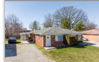
3934 S Walcott St, Indianapolis, IN (Duplex)

1,664 SF 4 Beds, 2 Baths Occupancy - Leased 2023-2024 - Leased 2024-2025