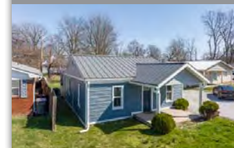
3933 S Walcott St, Indianapolis, IN

1,050 SF 3 Beds, 1 Bath Occupancy - Leased 2023-2024 - Leased 2024-2025