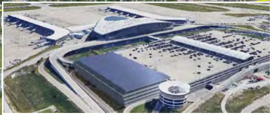
Indianapolis International Airport 13.5 Miles