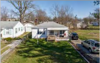
3817 S State Ave, Indianapolis, IN

1,001 SF 3 Beds, 1 1/2 Baths Occupancy - Leased 2023-2024 - Leased 2024-2025