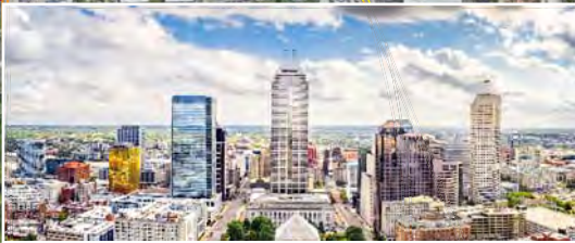
Downtown Indianapolis 5 Miles