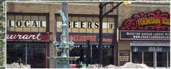
Fountain Square 3.3 Miles