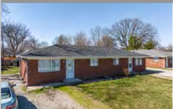
3946 S Walcott St, Indianapolis, IN (Duplex)

1,674 SF 4 Beds, 2 Baths Occupancy - Leased 2023-2024 - Leased 2024-2025