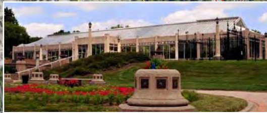
Garfield Park 2.5 Miles