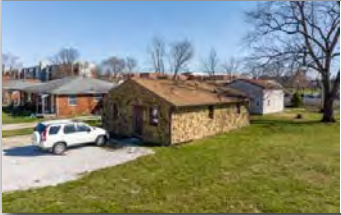
1141 Standish Ave, Indianapolis, IN

851 SF 2 Beds, 1 Bath Occupancy - Leased 2023-2024 - Leased 2024-2025