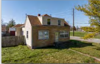
3702 Aurora St, Indianapolis, IN

2,016 SF 5 Beds, 2 Baths Occupancy - Leased 2023-2024 - Leased 2024-2025