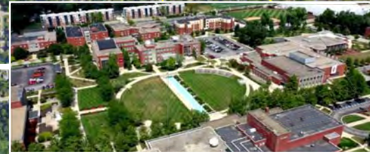
University of Indianapolis Blocks Away