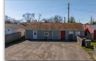
3704 Aurora St, Indianapolis, IN

920 SF 2 Beds, 1 Bath Occupancy - Leased 2023-2024 - Leased 2024-2025