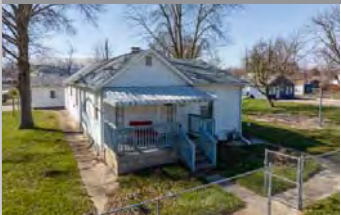
3740 Asbury St, Indianapolis, IN

1,104 SF 2 Beds, 1 Bath Occupancy - Leased 2023-2024 - Leased 2024-2025