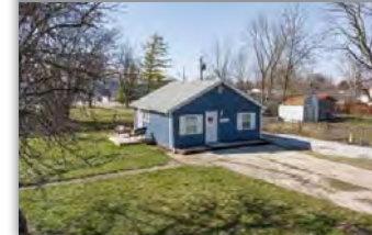
3732 Asbury St, Indianapolis, IN

552 SF 1 Bed, 1 Bath Occupancy - Leased 2023-2024 - Leased 2024-2025