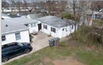
3819 S State Ave, Indianapolis, IN

920 SF 2 Beds, 1 Bath Occupancy - Leased 2023-2024 - Leased 2024-2025