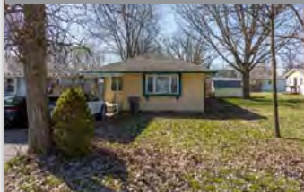
3810 S Walcott St, Indianapolis, IN

1,001 SF 3 Beds, 1 Bath Occupancy - Leased 2023-2024 - Avail. 2024-2025