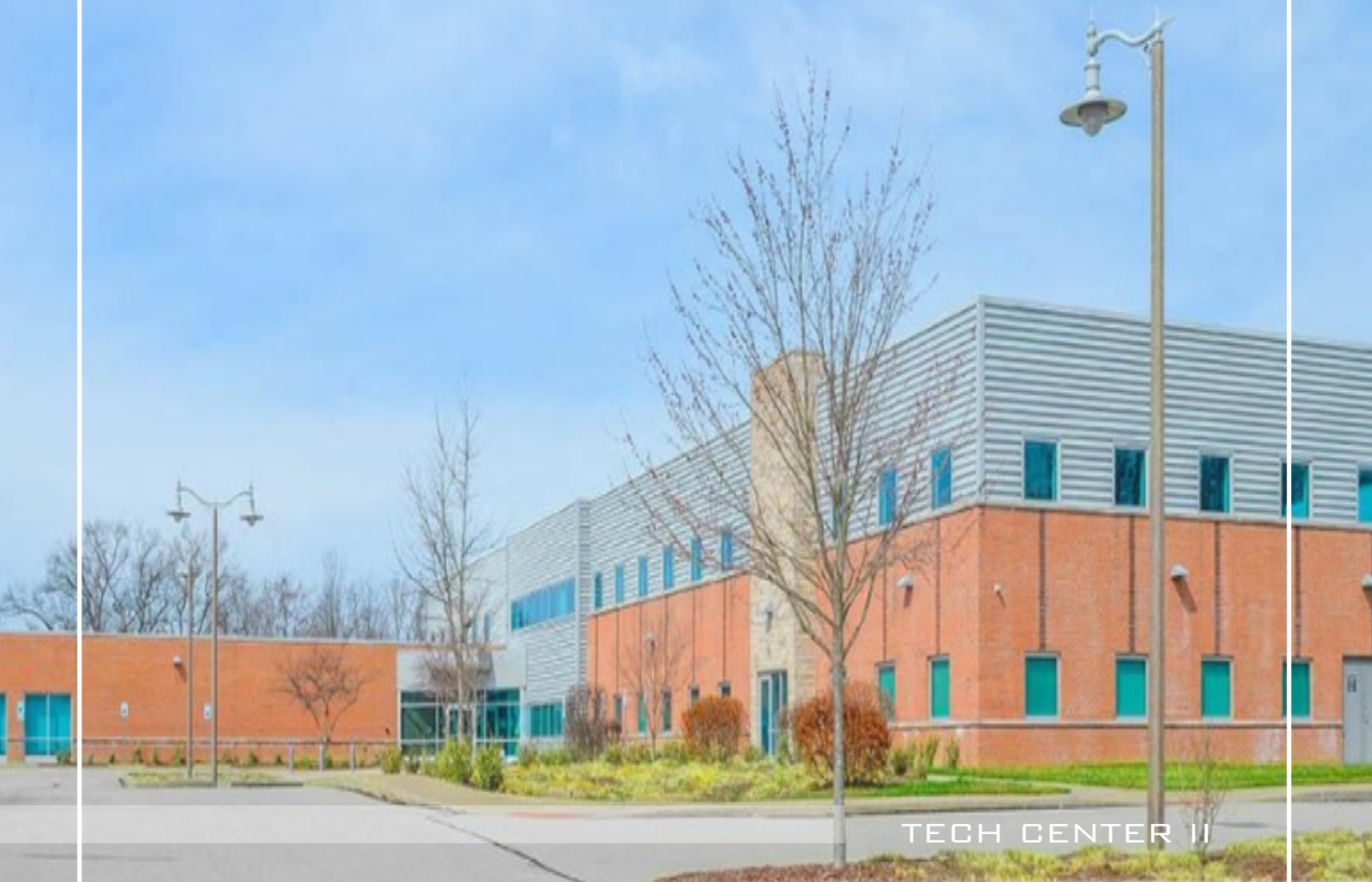
TECH CENTER II

REGIONAL INDUSTRIAL DEVELOPMENT CORPORATION