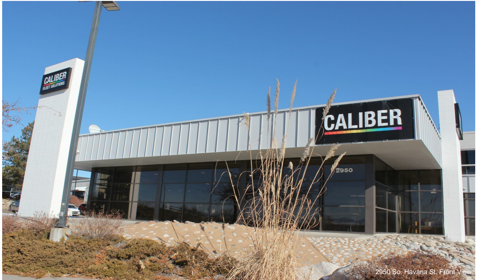
2950 So. Havana St. Front View