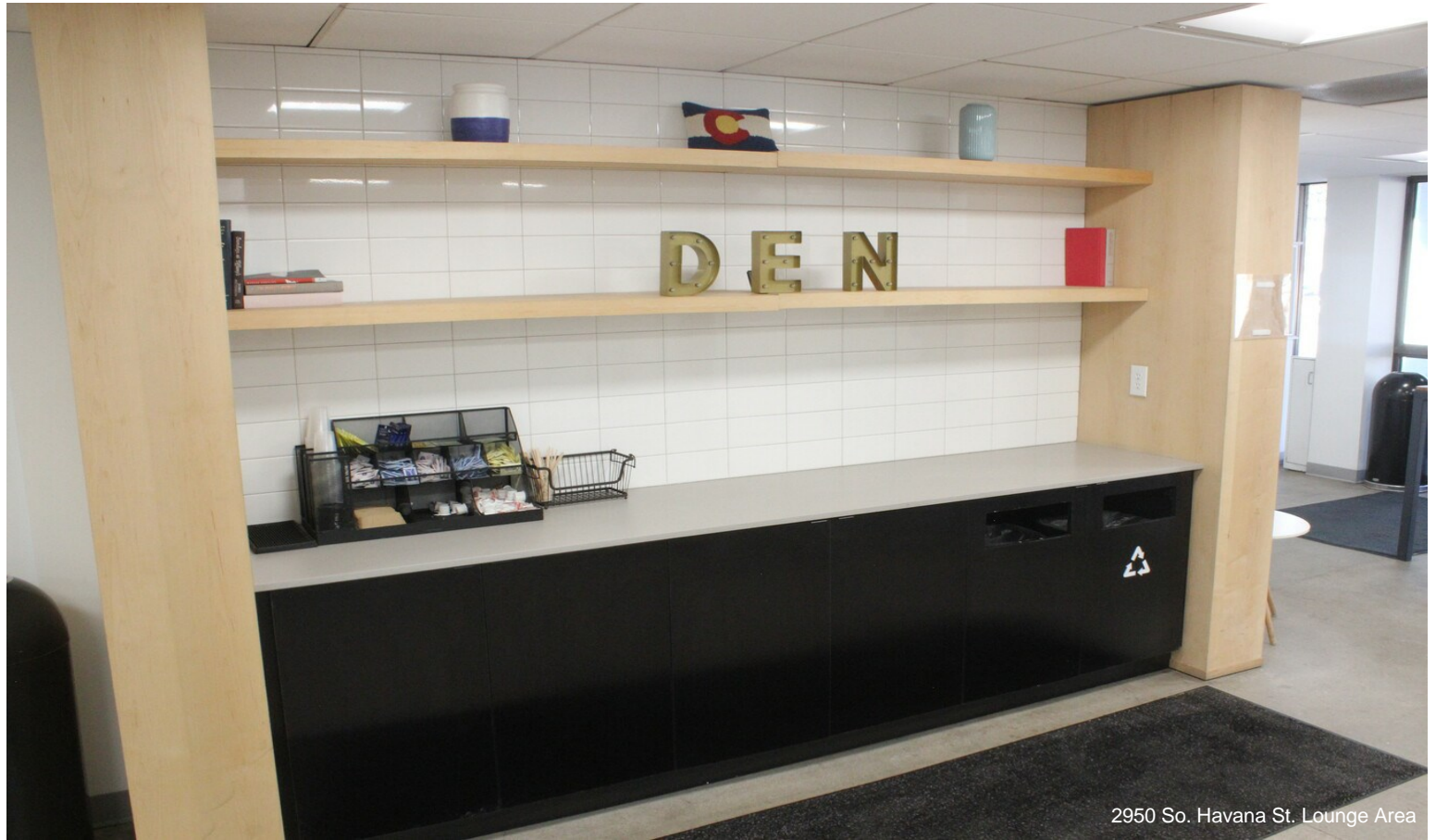
2950 So. Havana St. Lounge Area