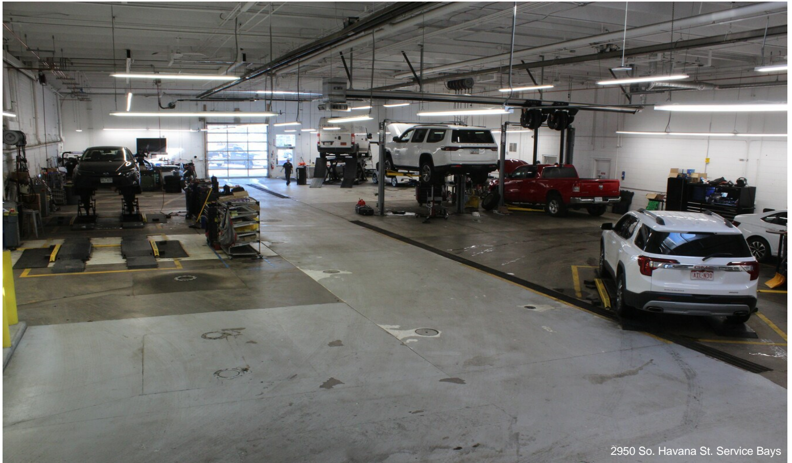
2950 So. Havana St. Service Bays