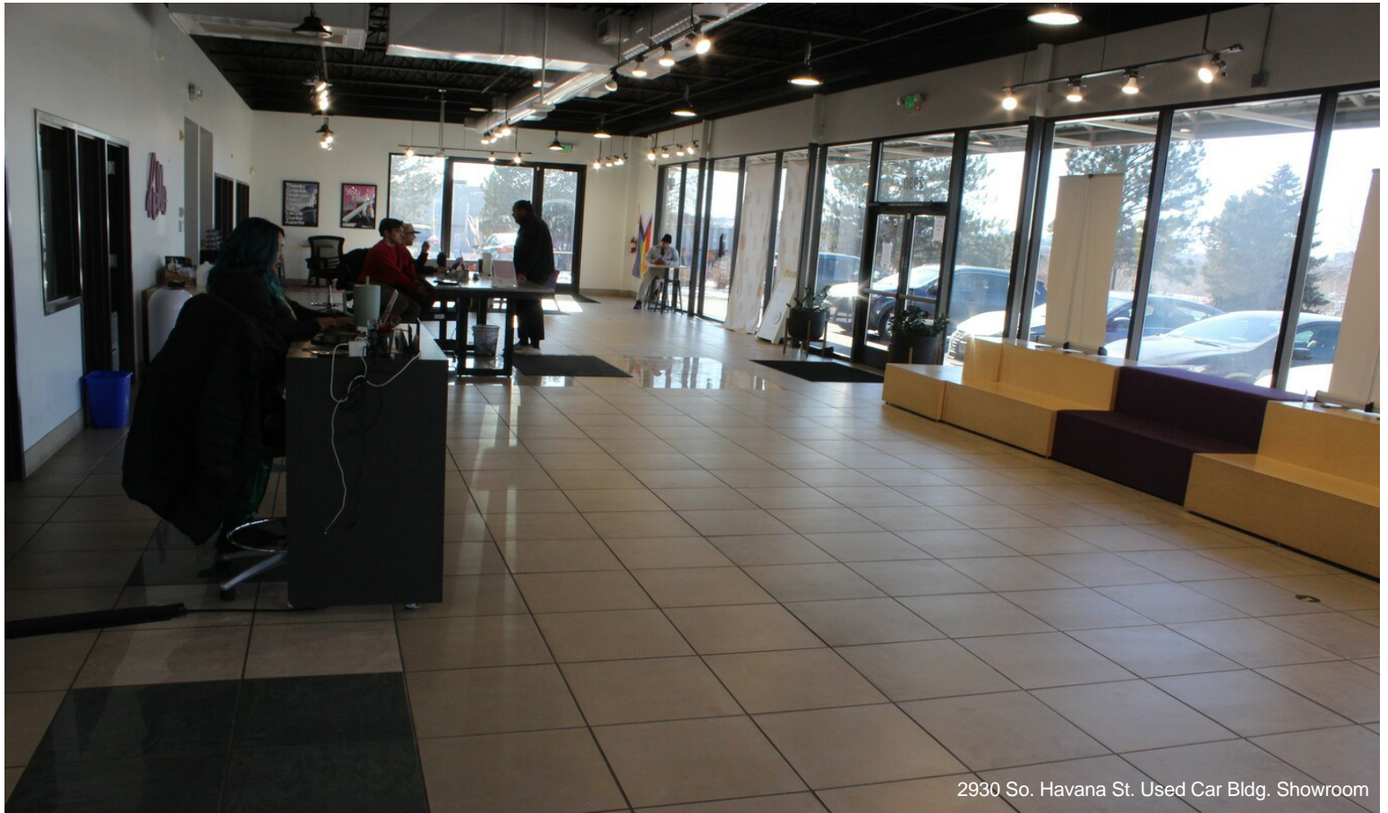
2930 So. Havana St. Used Car Bldg. Showroom