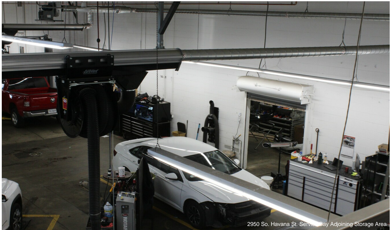
2950 So. Havana St. Service Bay Adjoining Storage Area