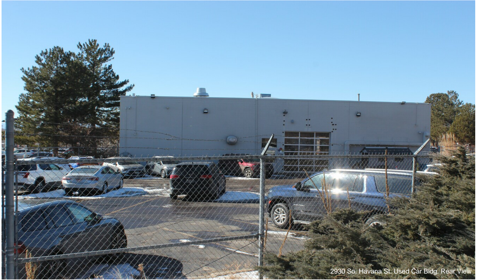
2930 So. Havana St. Used Car Bldg. Rear View