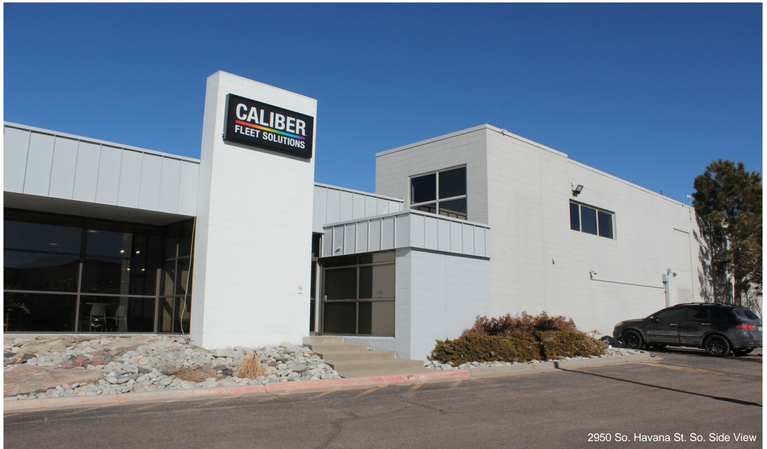
2950 So. Havana St. So. Side View