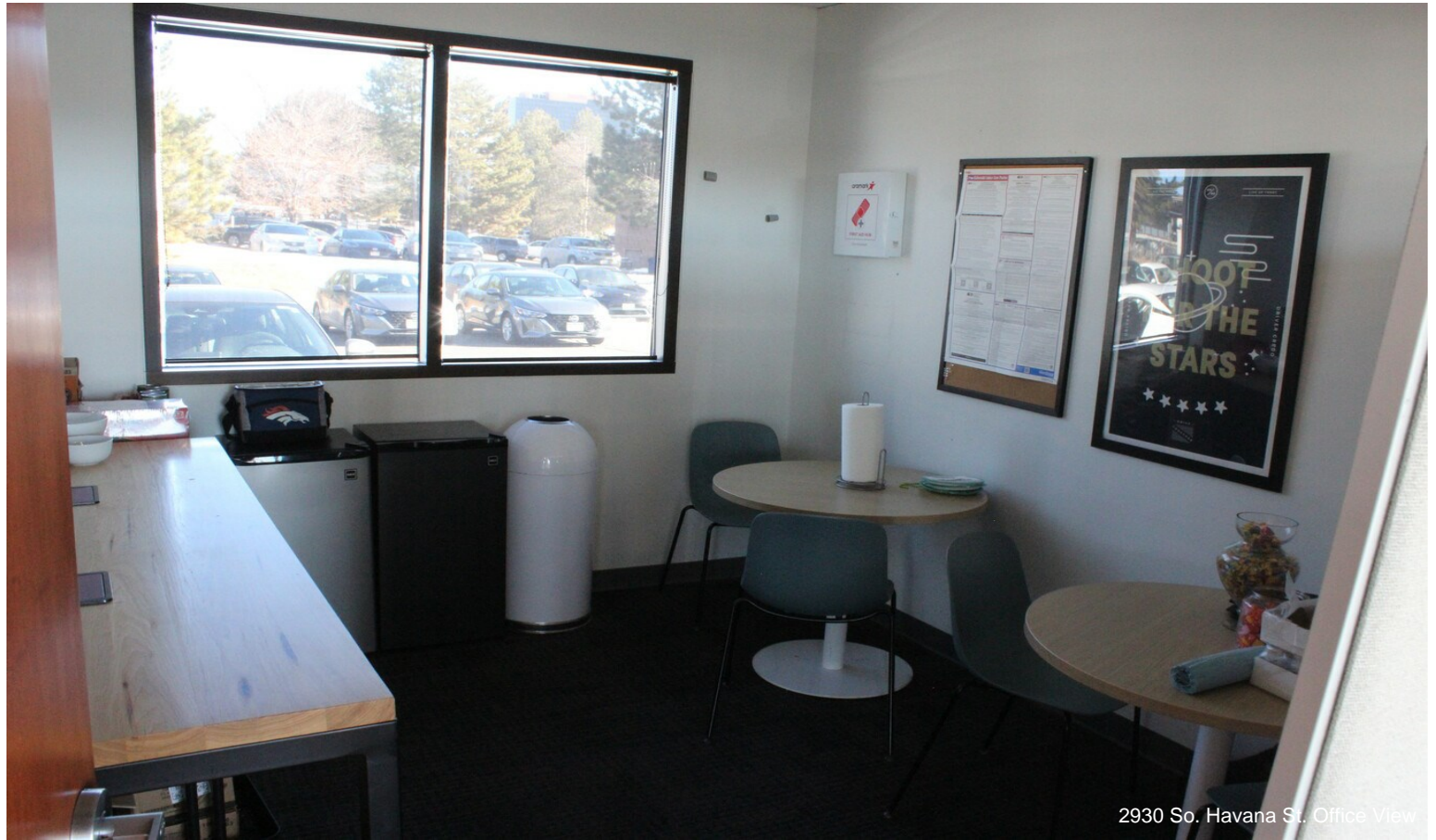
2930 So. Havana St. Office View