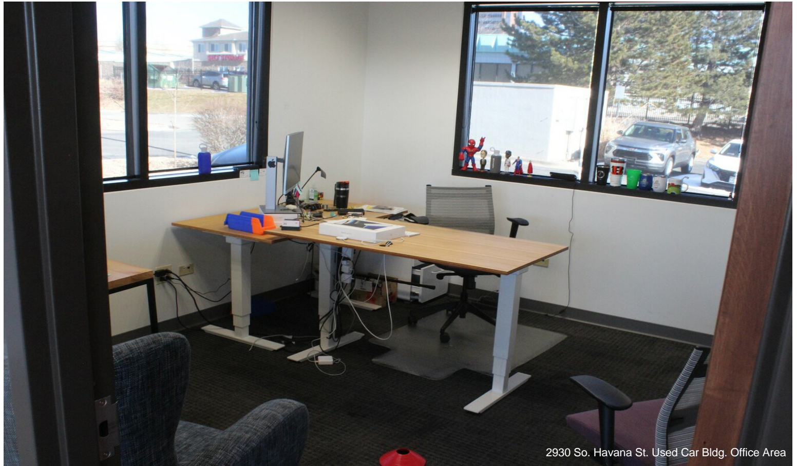
2930 So. Havana St. Used Car Bldg. Office Area