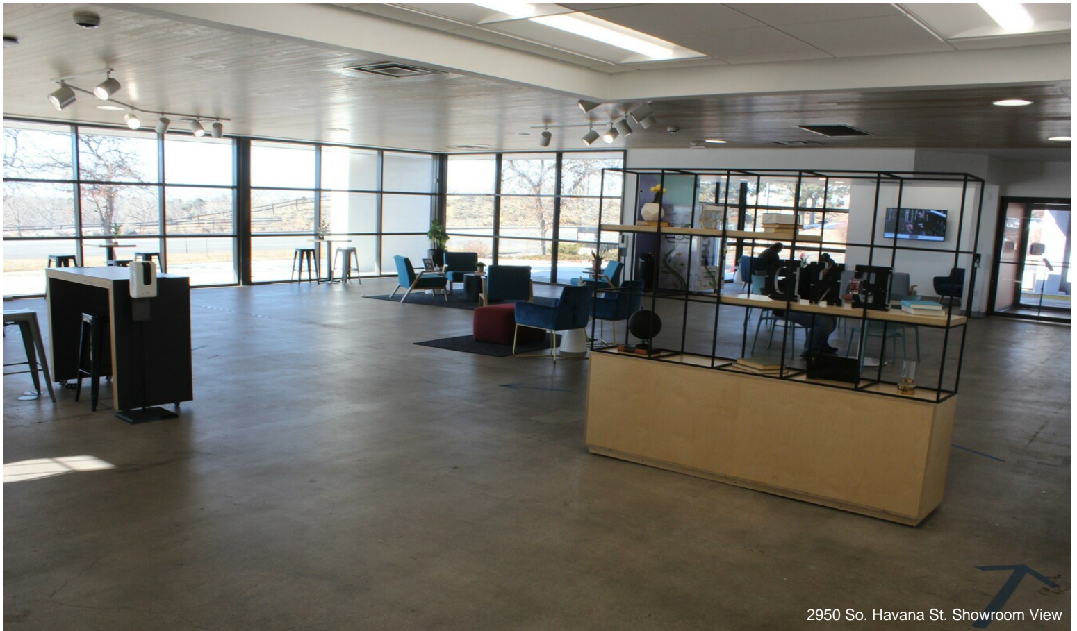
2950 So. Havana St. Showroom View