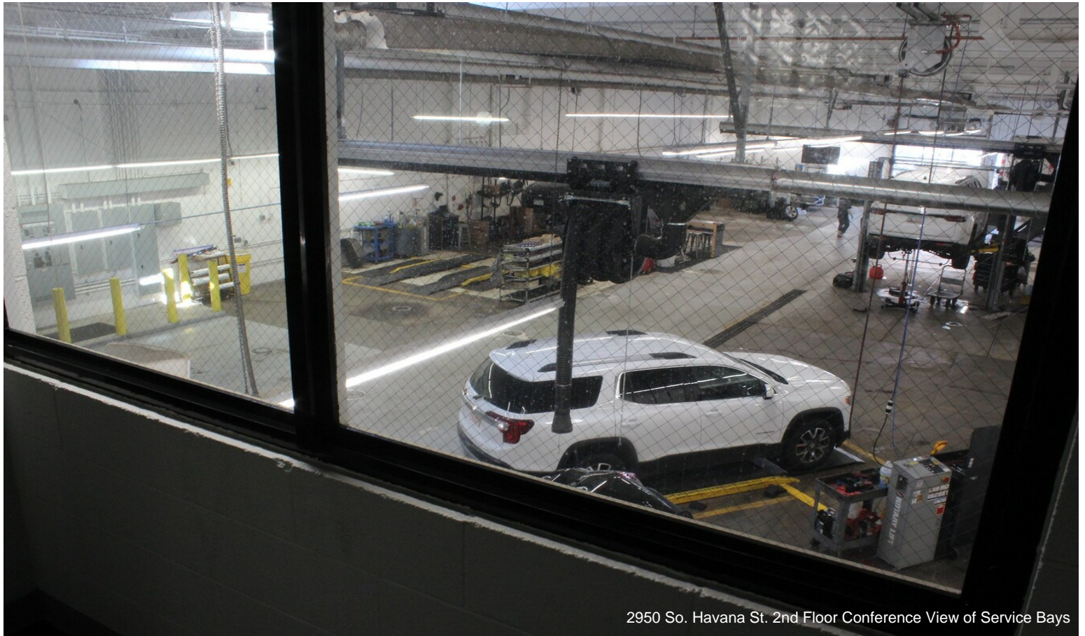
2950 So. Havana St. 2nd Floor Conference View of Service Bays