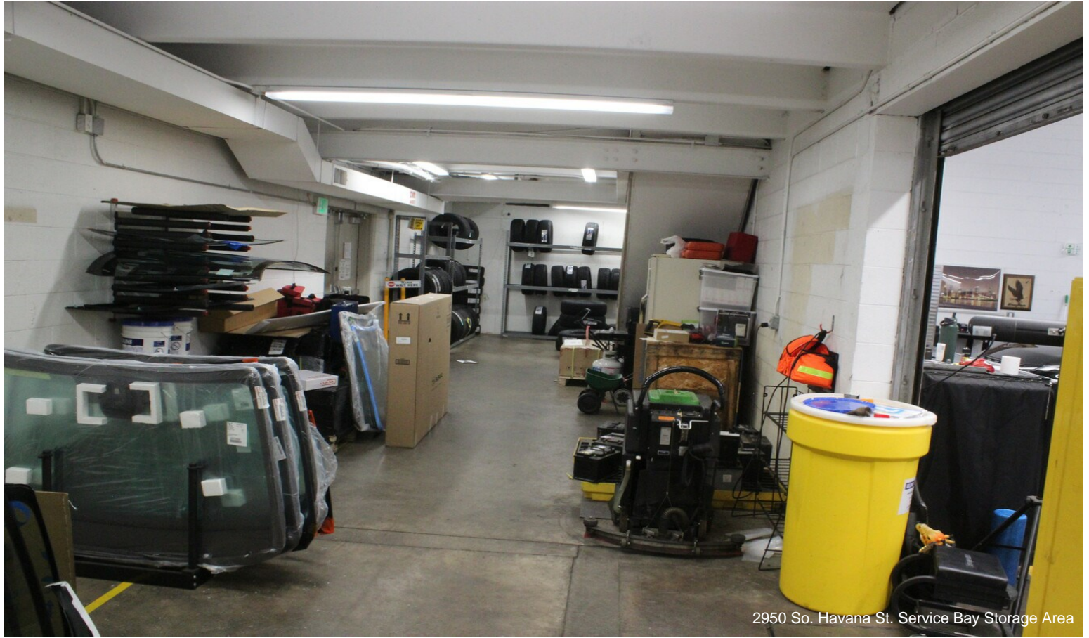
2950 So. Havana St. Service Bay Storage Area