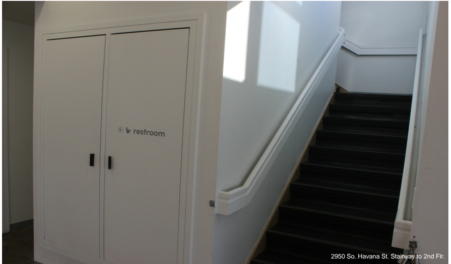
2950 So. Havana St. Stairway to 2nd Flr.