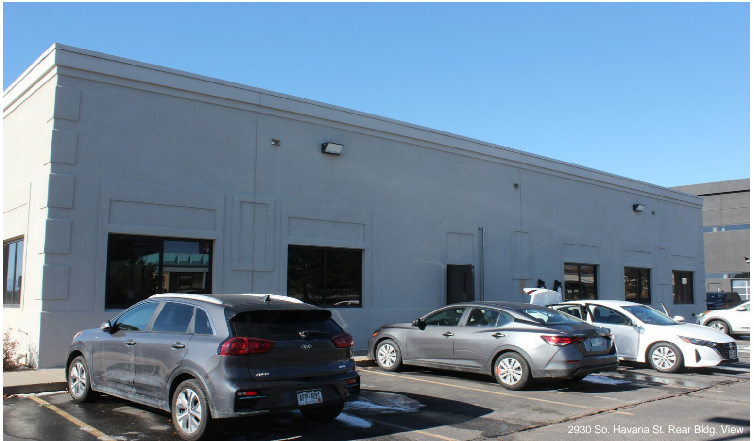
2930 So. Havana St. Rear Bldg. View