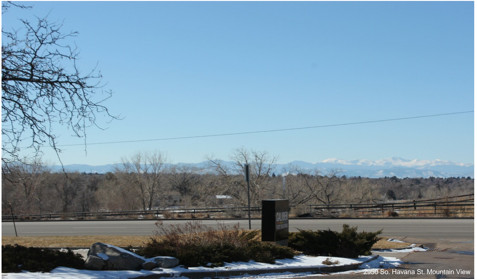
2950 So. Havana St. Mountain View