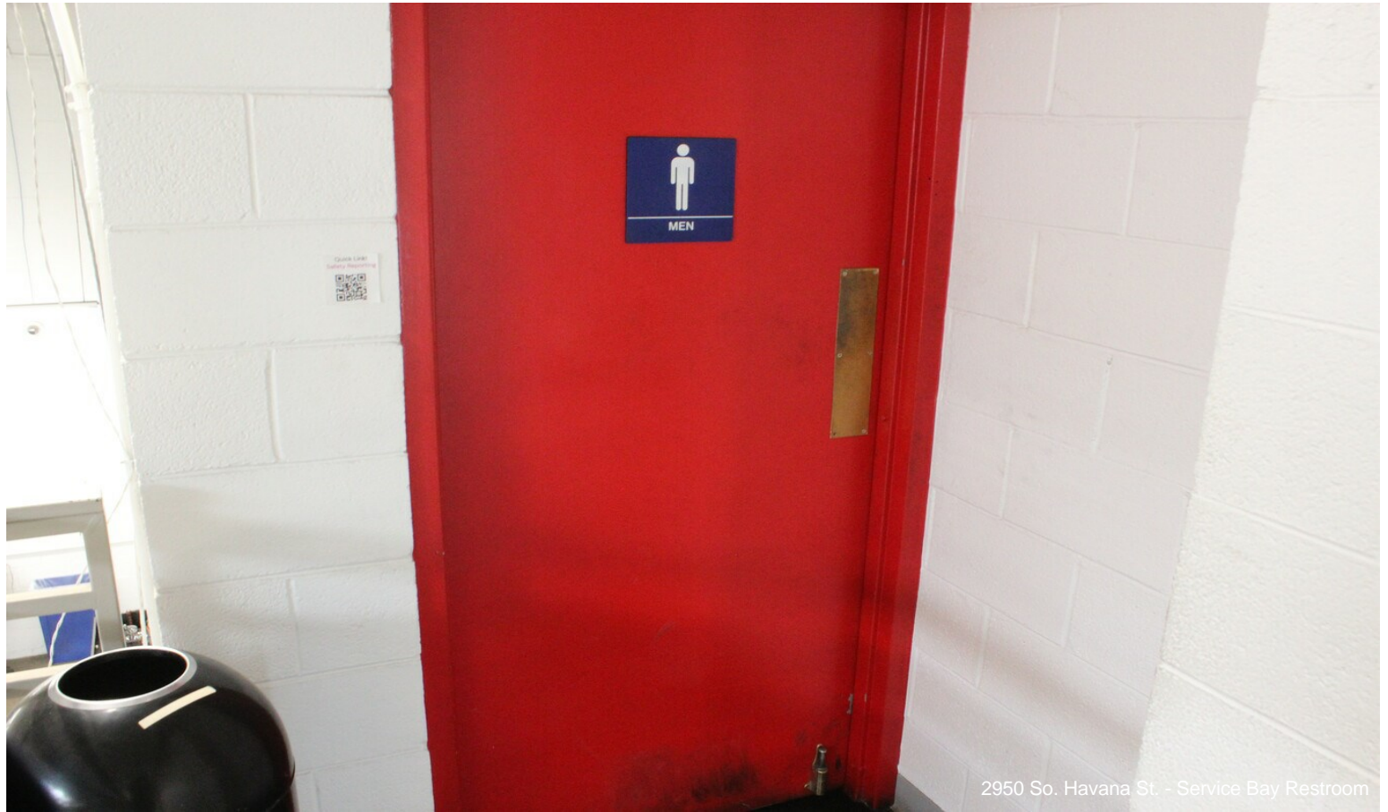
2950 So. Havana St. - Service Bay Restroom