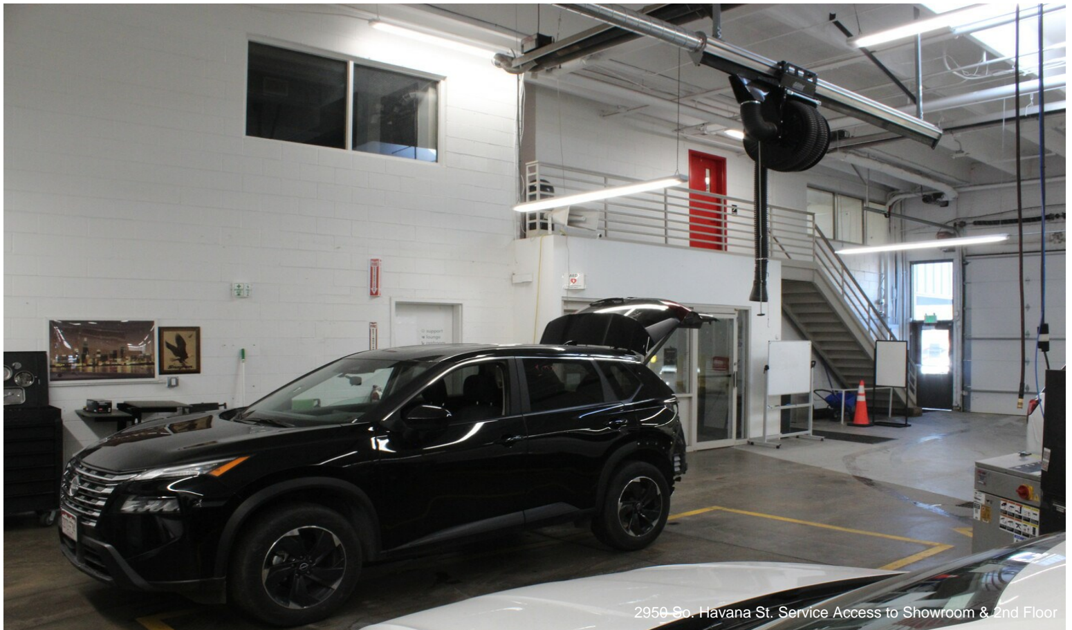
2950 So. Havana St. Service Access to Showroom & 2nd Floor