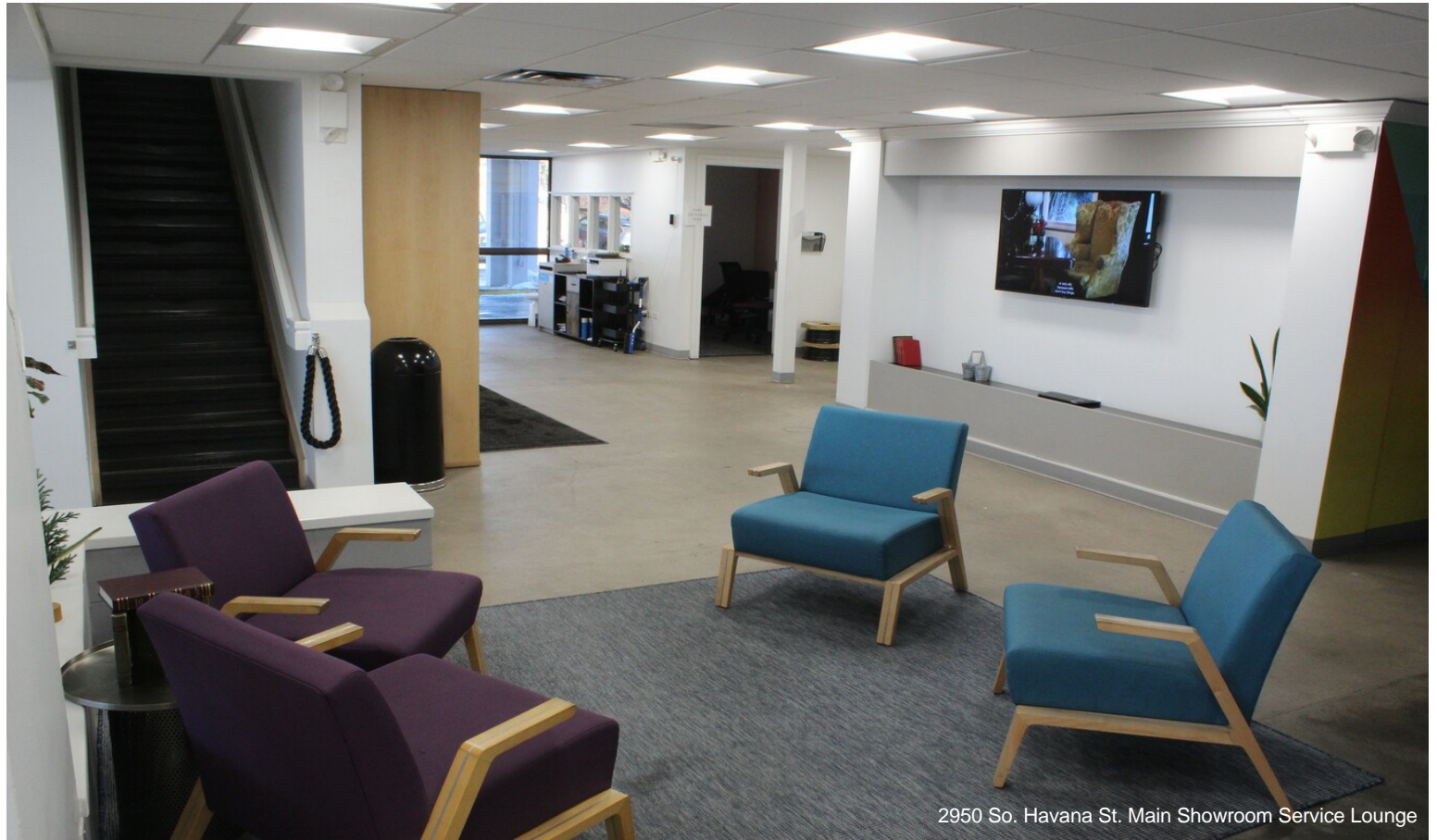
2950 So. Havana St. Main Showroom Service Lounge