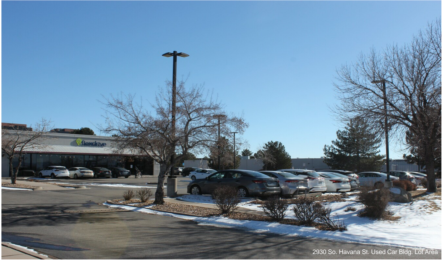
2930 So. Havana St. Used Car Bldg. Lot Area