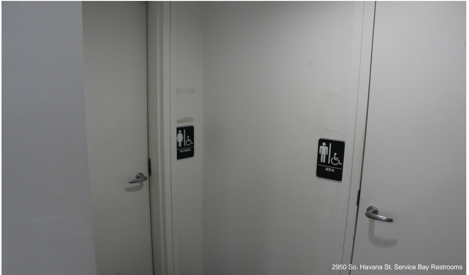
2950 So. Havana St. Service Bay Restrooms