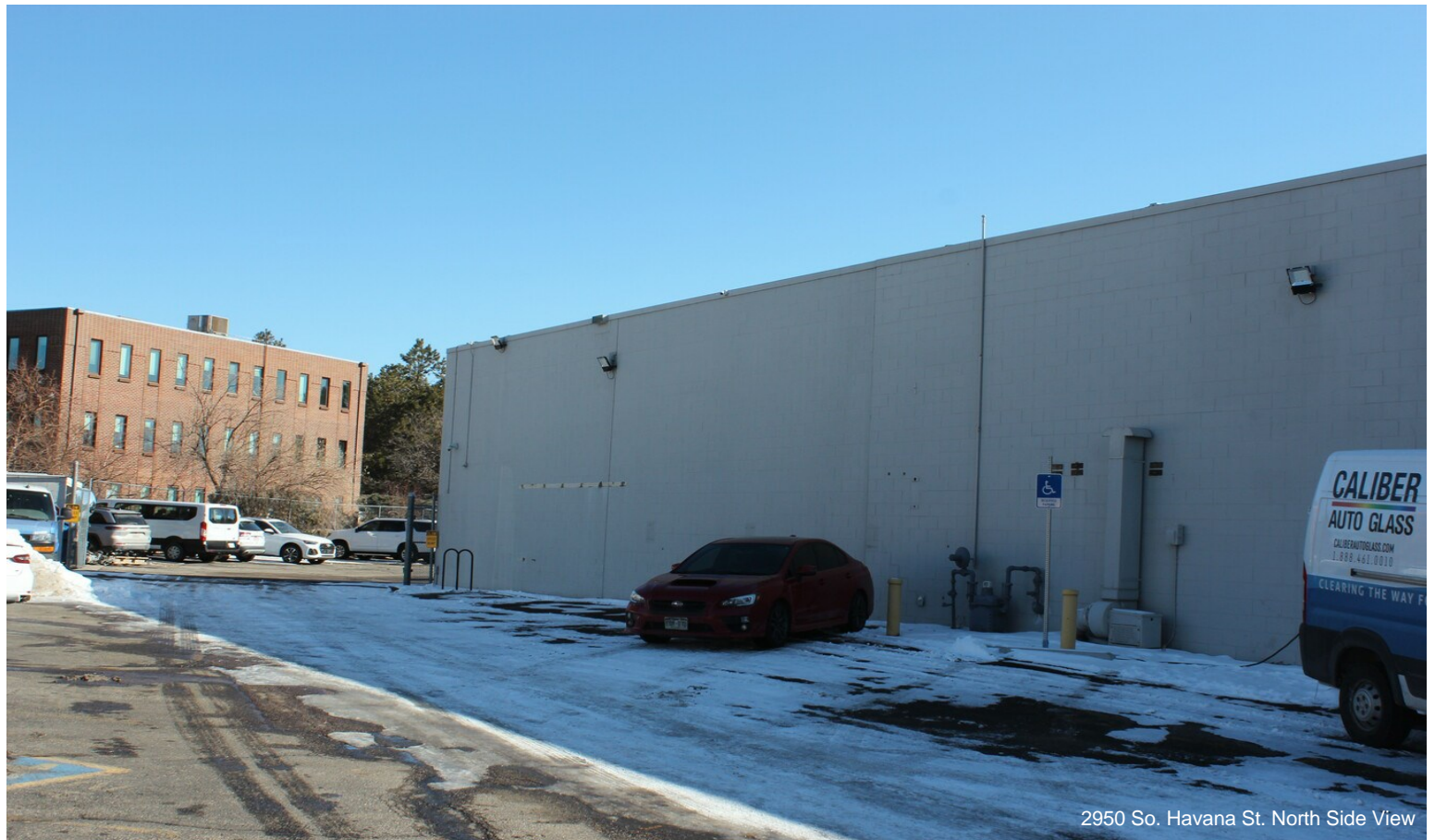
2950 So. Havana St. North Side View