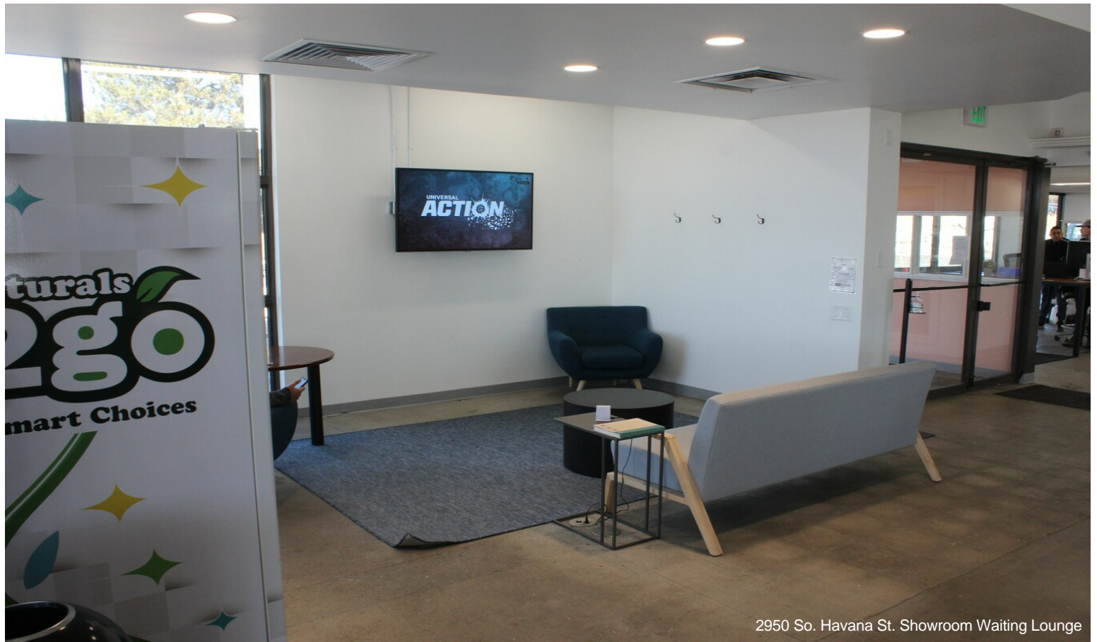
2950 So. Havana St. Showroom Waiting Lounge