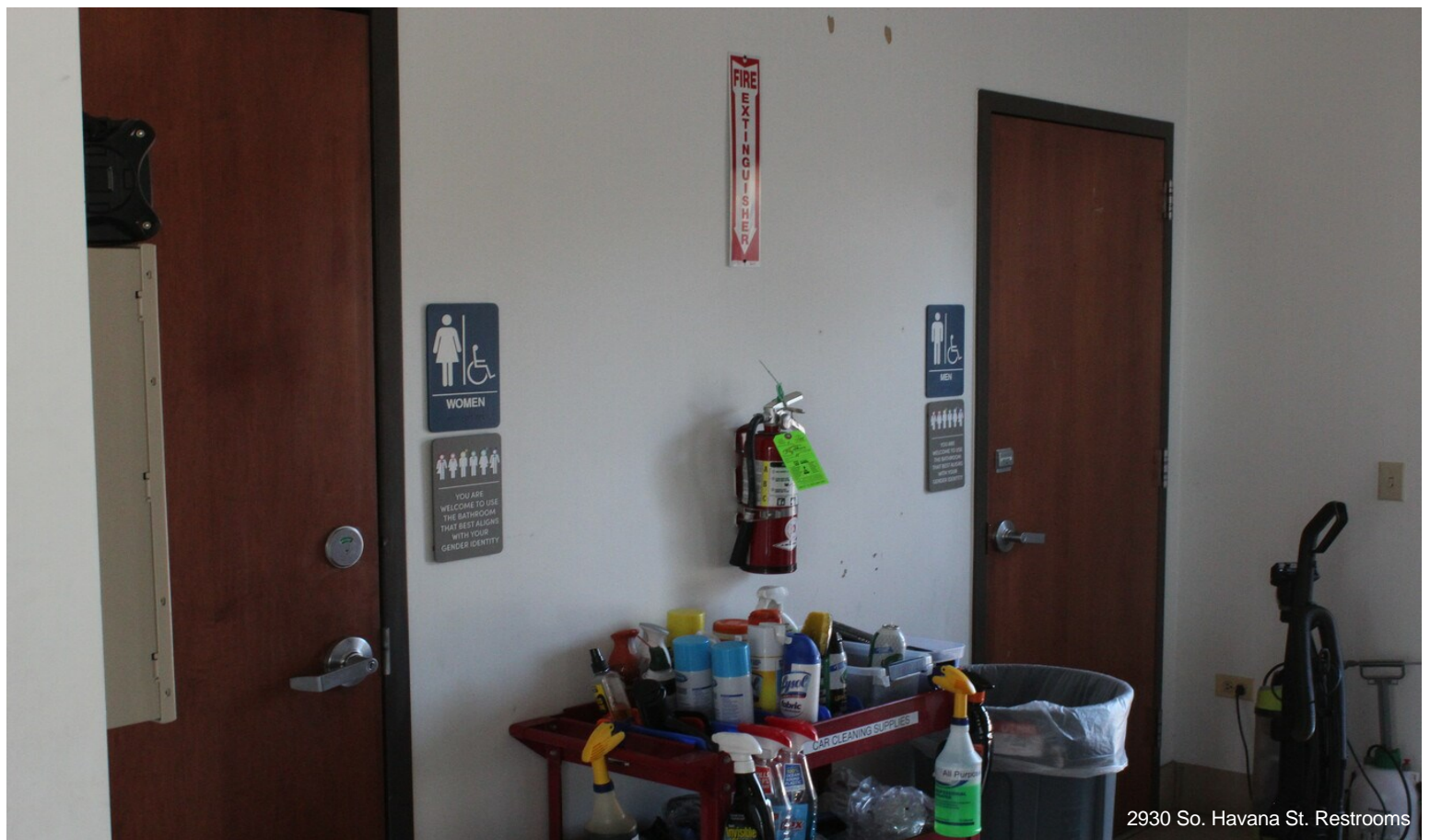
2930 So. Havana St. Restrooms