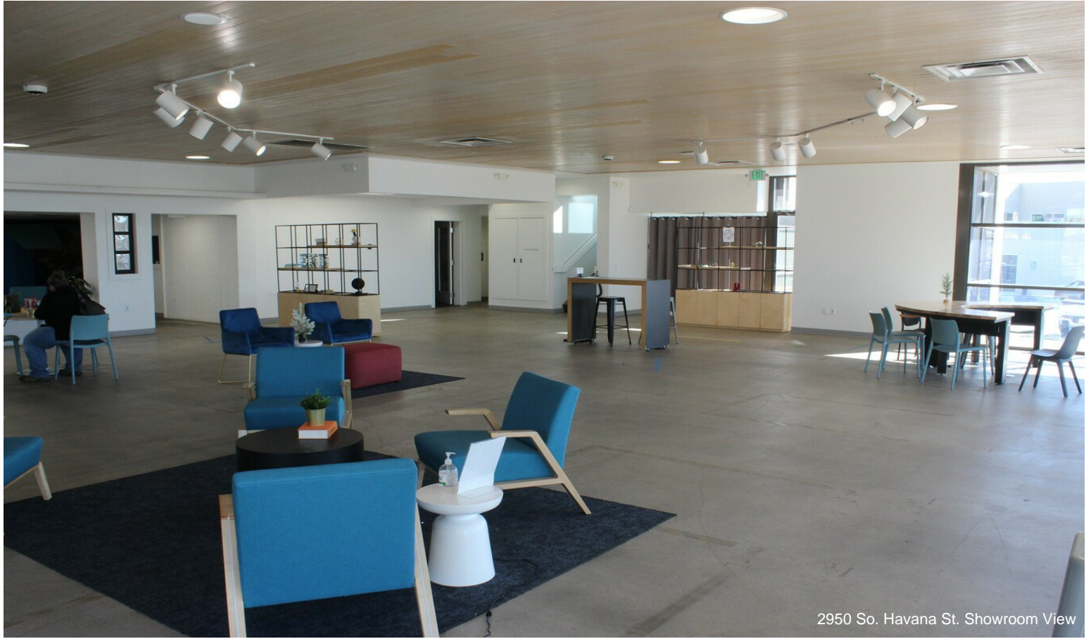
2950 So. Havana St. Showroom View