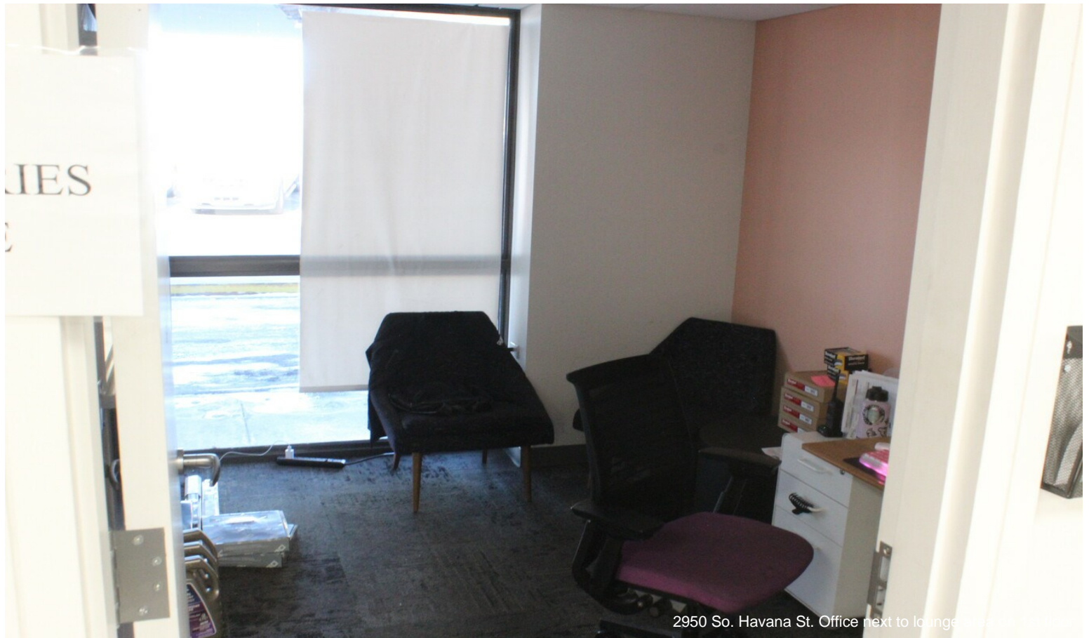
2950 So. Havana St. Office next to lounge area