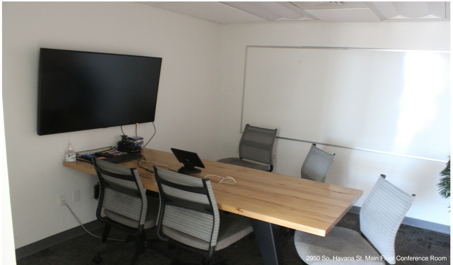
2950 So. Havana St. Main Floor Conference Room