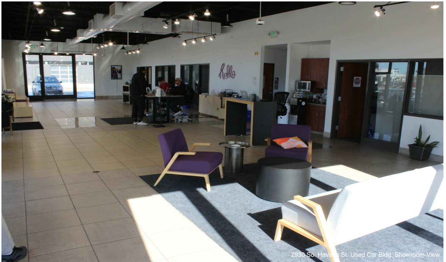
2930 So. Havana St. Used Car Bldg. Showroom View