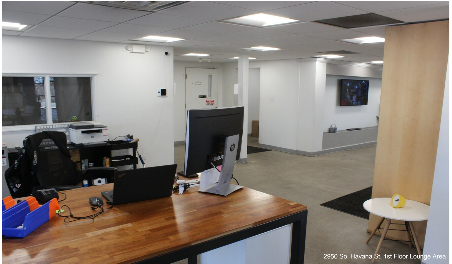
2950 So. Havana St. 1st Floor Lounge Area