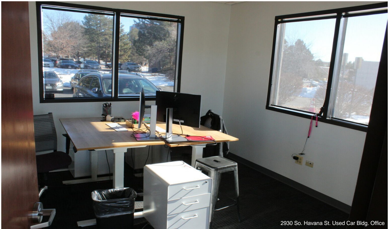
2930 So. Havana St. Used Car Bldg. Office