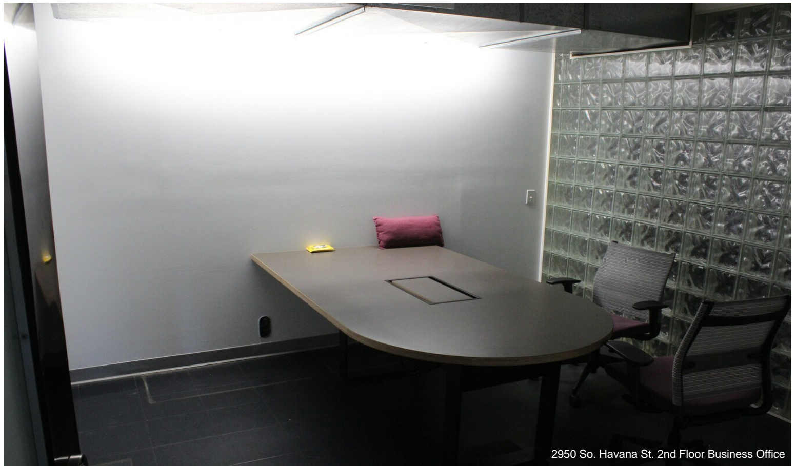
2950 So. Havana St. 2nd Floor Business Office