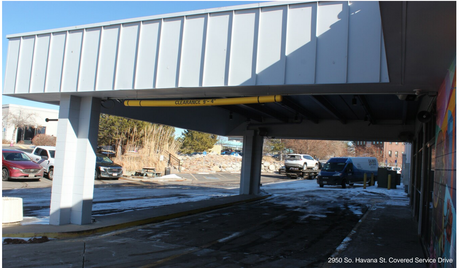
2950 So. Havana St. Covered Service Drive