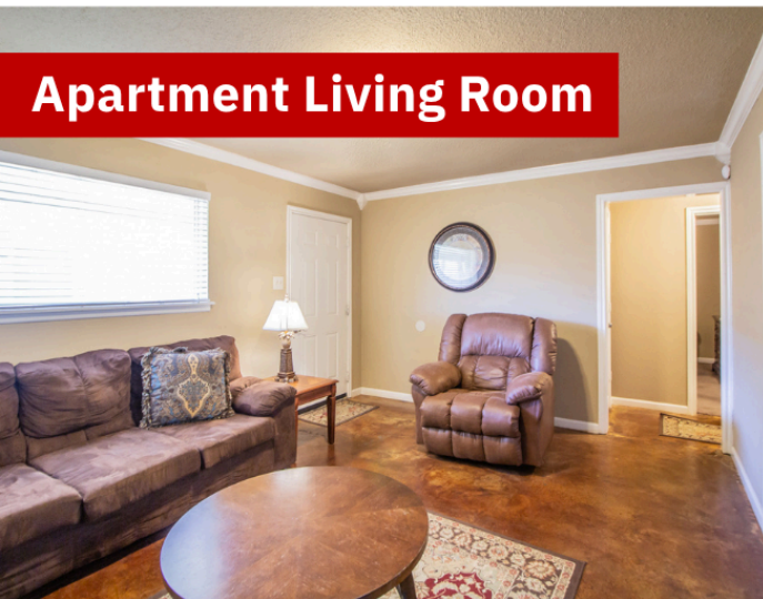
Apartment Living Room