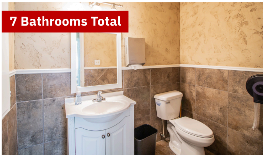
7 Bathrooms Total