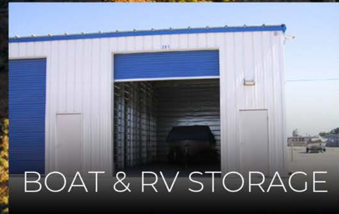
BOAT & RV STORAGE