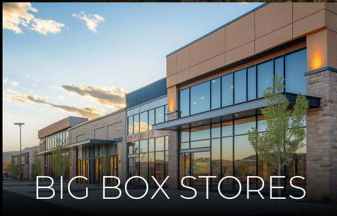
BIG BOX STORES