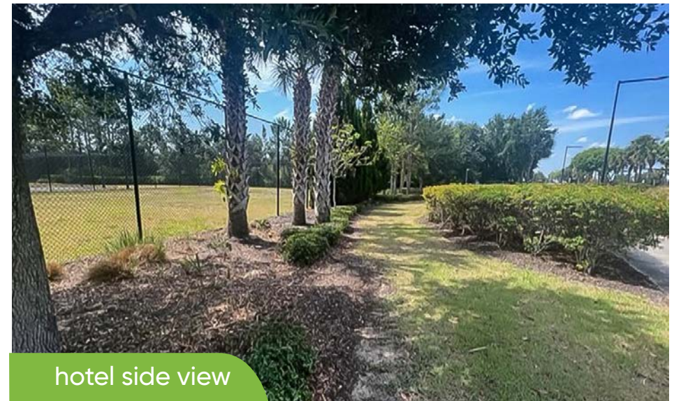
hotel side view