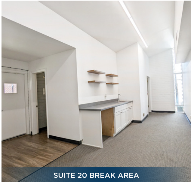
SUITE 20 BREAK AREA