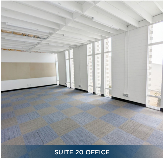
SUITE 20 OFFICE