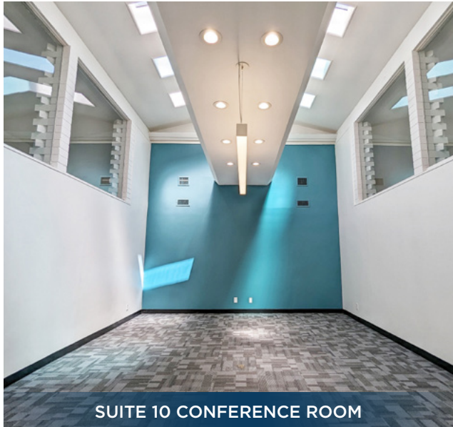
SUITE 10 CONFERENCE ROOM