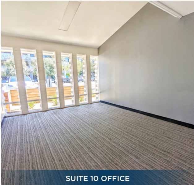
SUITE 10 OFFICE