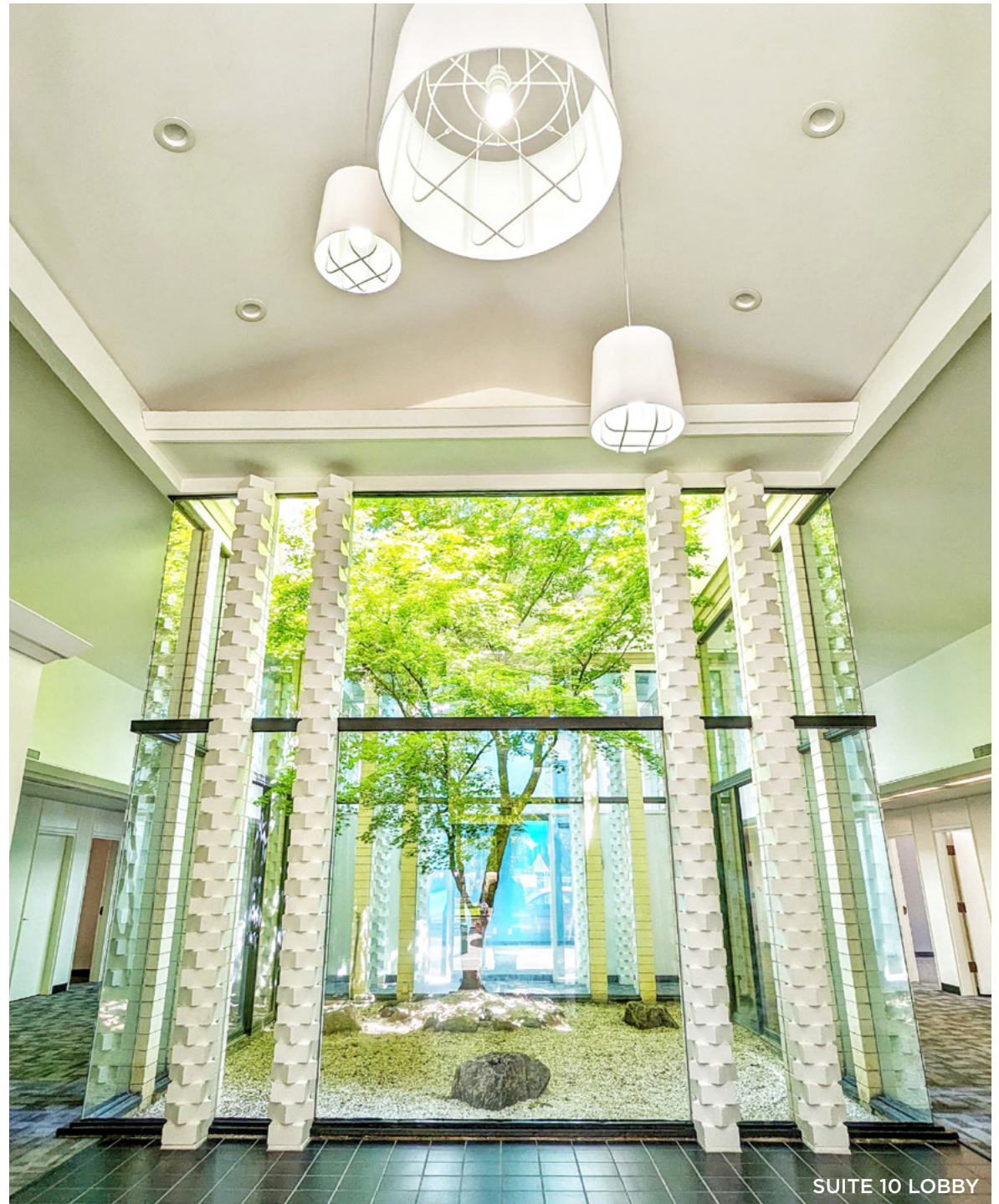
SUITE 10 LOBBY