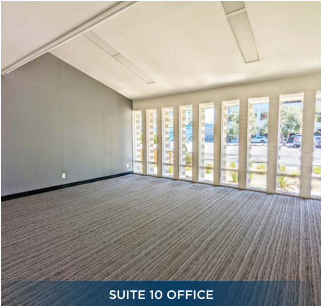
SUITE 10 OFFICE