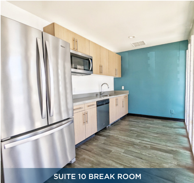
SUITE 10 BREAK ROOM