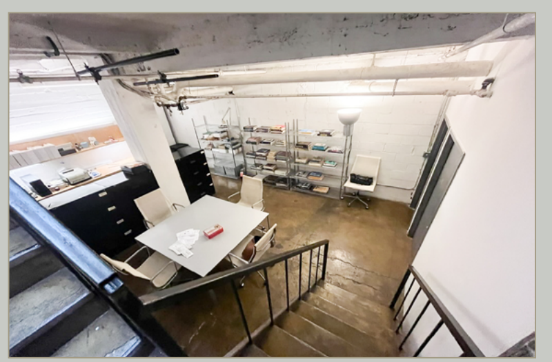
Part. Lower Level