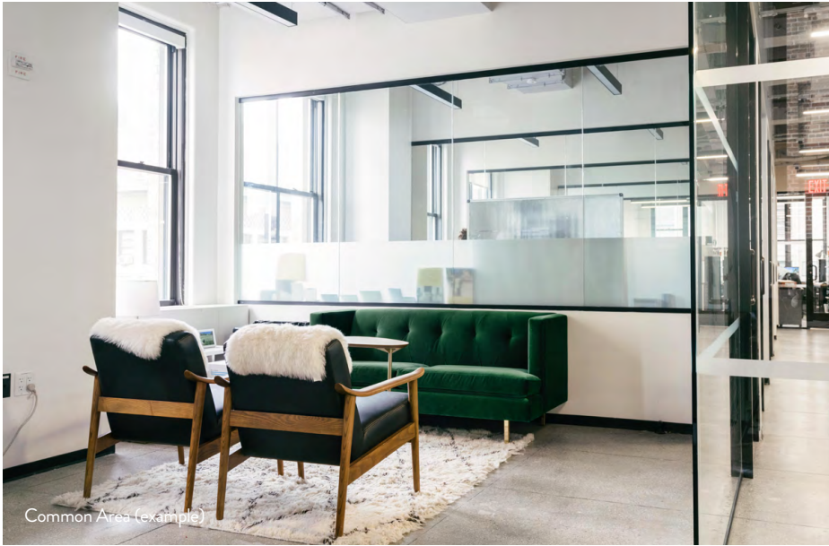
Common Area (example)