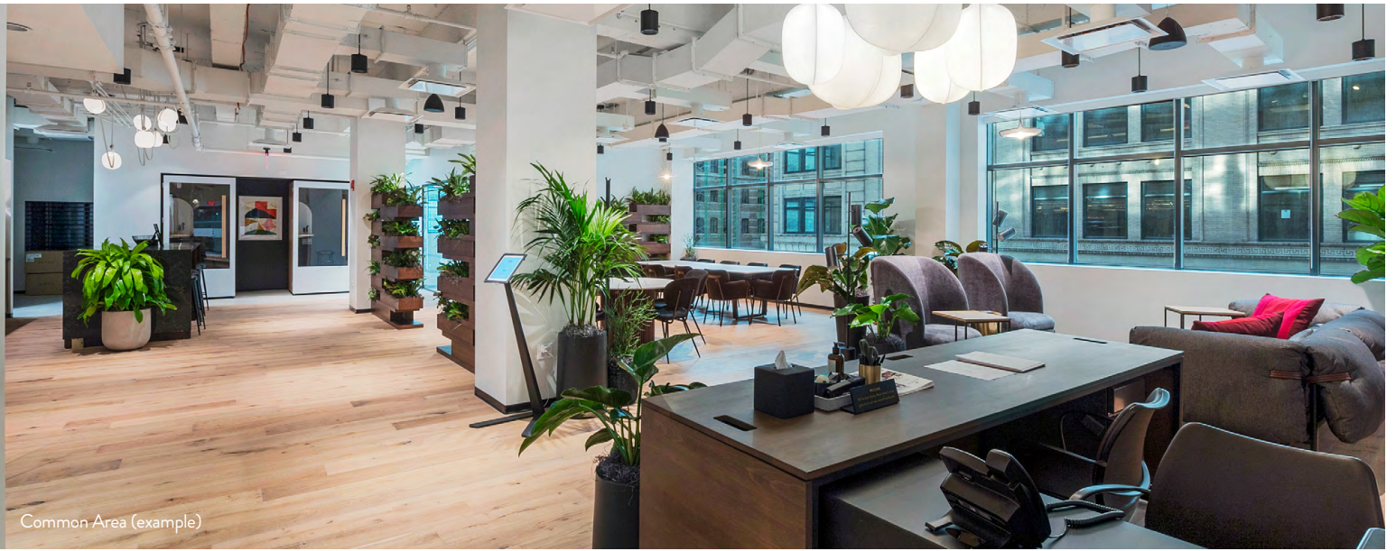
Common Area (example)