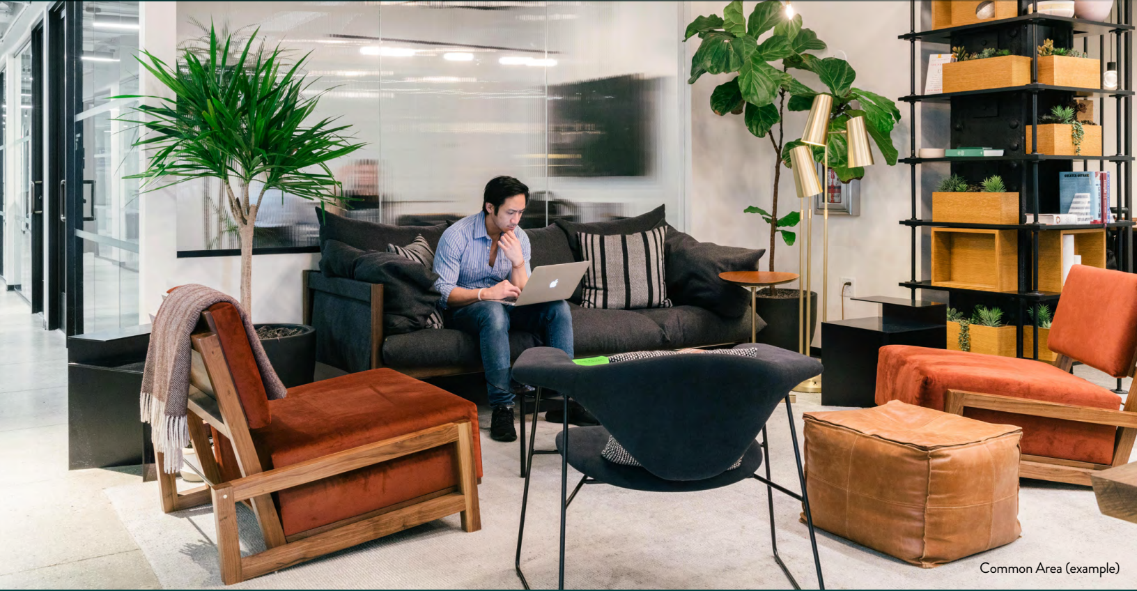
Common Area (example)