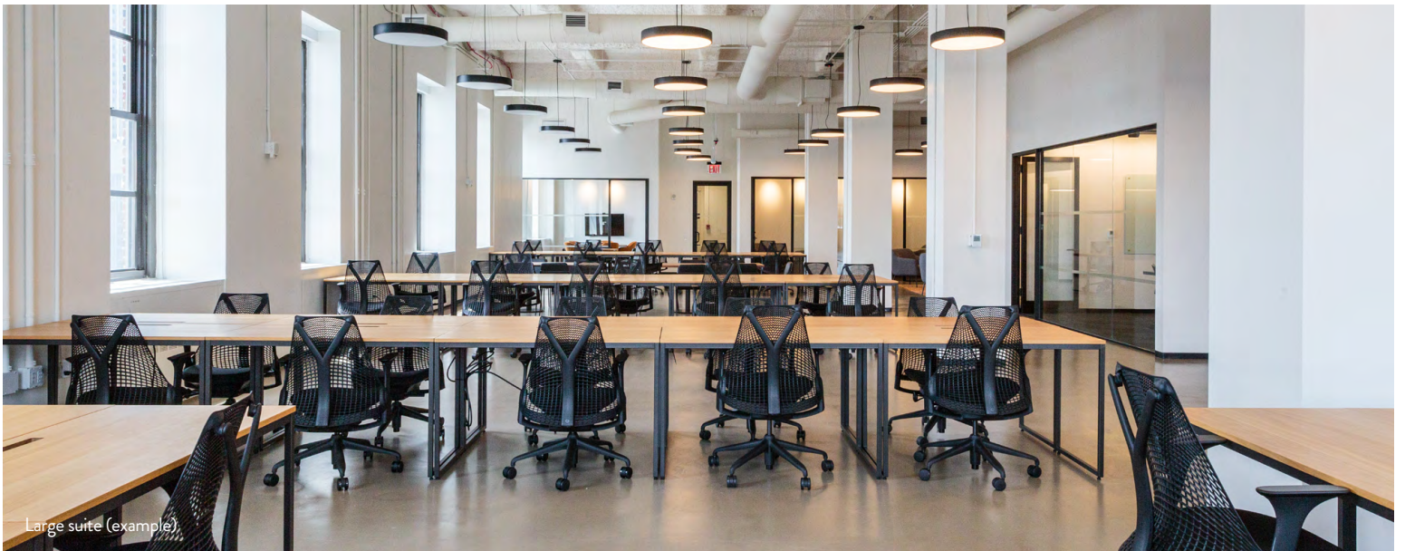
Large suite (example)