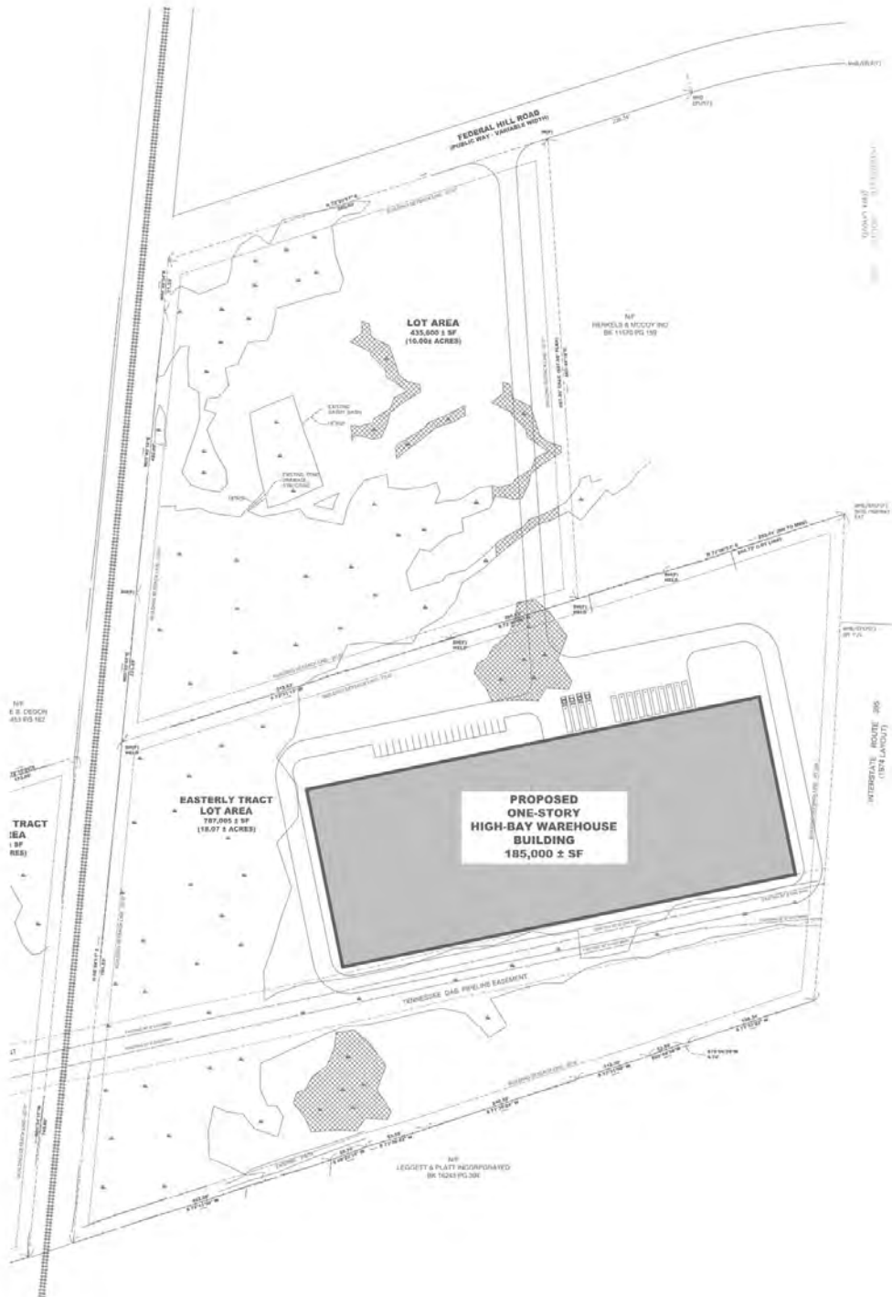
185,000 SF CONCEPT PLAN