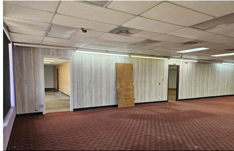
Interior South End