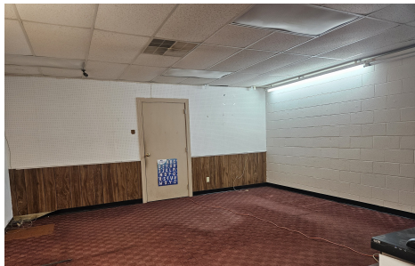
Office South End