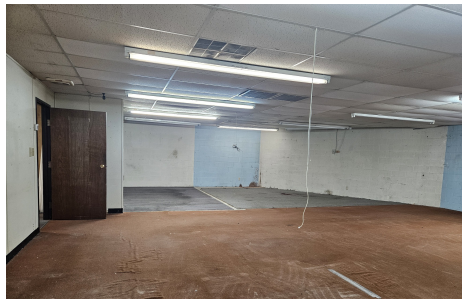
Large Back Room with Ground Level Door