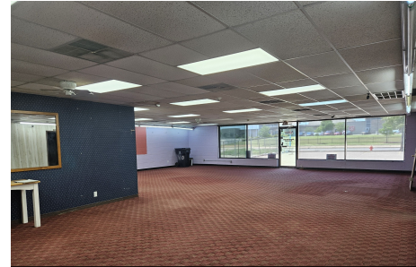
Interior South End