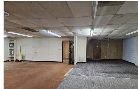
Large Back Room with Ground Level Door