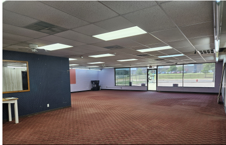
Interior South End