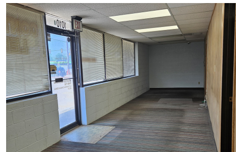
Interior North End