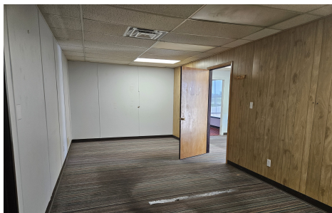
Office North End