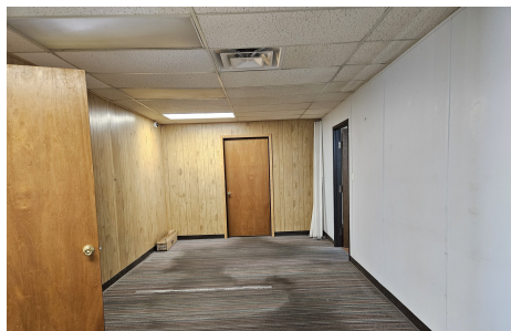
Office North End