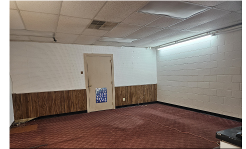
Office South End