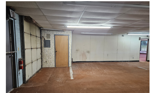
Large Back Room with Ground Level Door