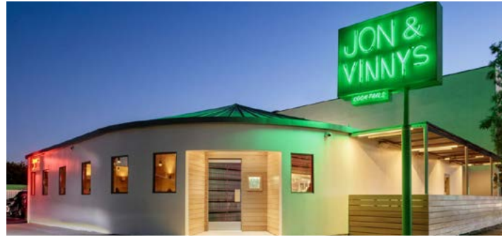
Jon & Vinny's is a local favorite spot offering delicious Italian-American comfort food, including wood-fired pizzas and handmade pastas.

No warranty or representation is made to the accuracy of the foregoing information. Terms of sale or lease are subject to change or withdrawal without notice. ©2024 INDUSTRY PARTNERS, INC.