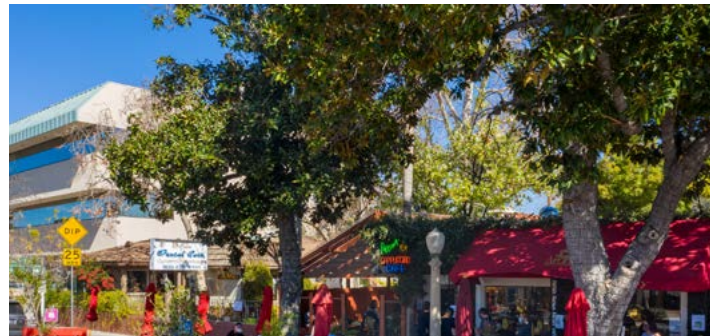
Aroma Cafe. Cozy cafe with breakfast, sandwich, salad, pastry & coffee options plus backyard patio seating.