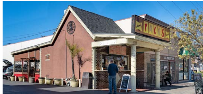
Henry's Tacos. Popular, longtime taco stand offering window service, a simple menu & a few outdoor tables.