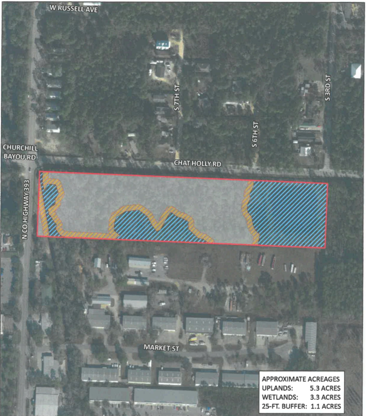
EXHIBIT 6 WETLAND JURISDICTION MAP WALTON COUNTY LOT 64 CO. HWY. 393 N. 26-25-20-33200-000-0640 DACULA DESIGN GROUP, LLC