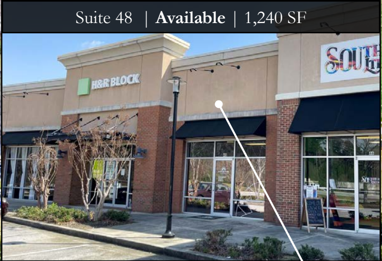
Suite 48 | Available | 1,240 SF