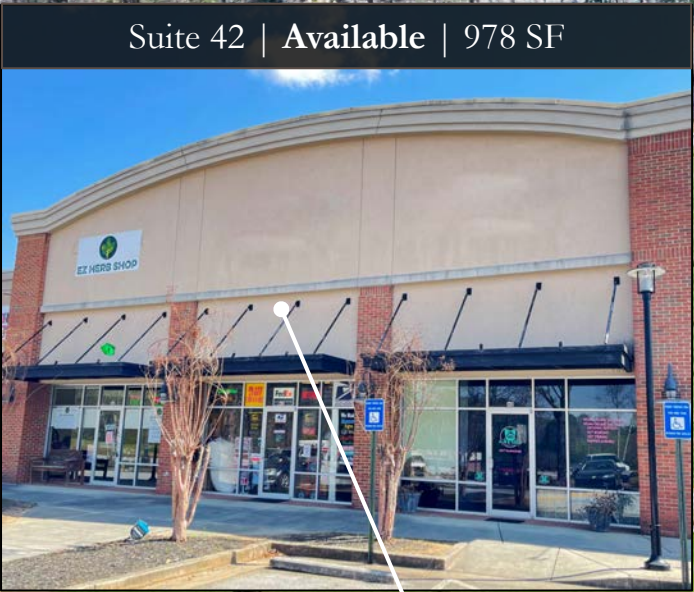
Suite 42 | Available | 978 SF