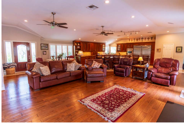
LIVING ROOM & KITCHEN