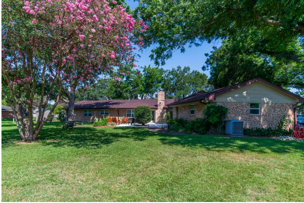
REAR OF HOME