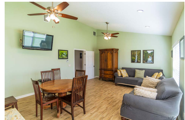
APARTMENT LIVING AREA