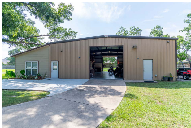
APARTMENT & BARN