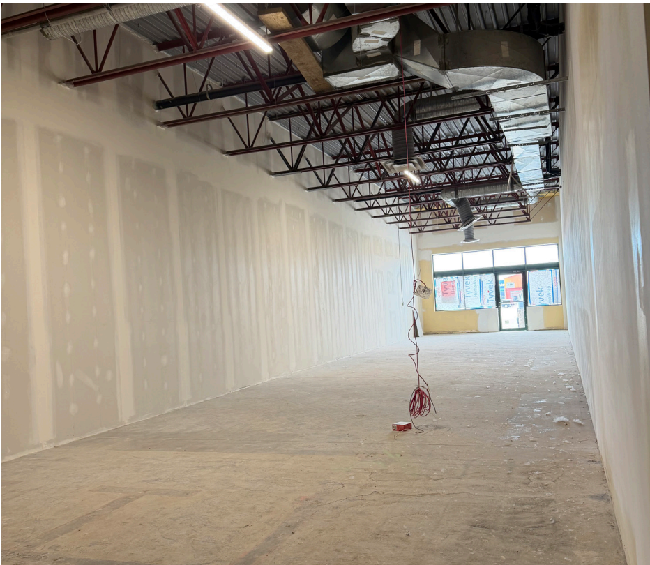
UNIT 162C | 1,394 SF