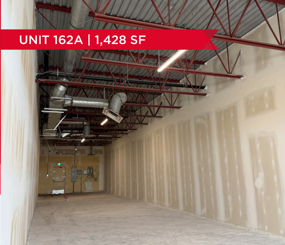
UNIT 162A | 1,428 SF