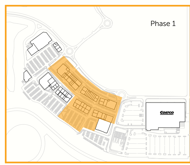
BUILDING 5 - CONCEPT RENDER