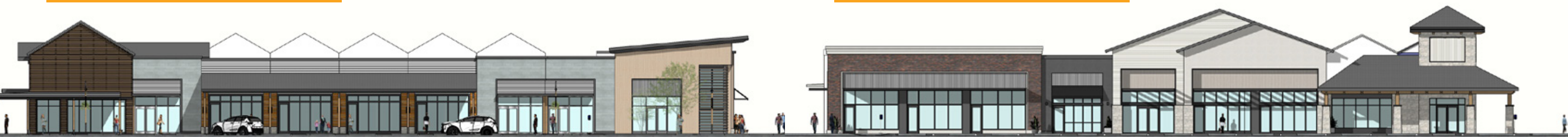
BUILDING 9 - CONCEPT RENDER