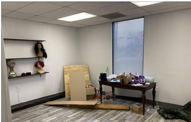
SUITE 105 A