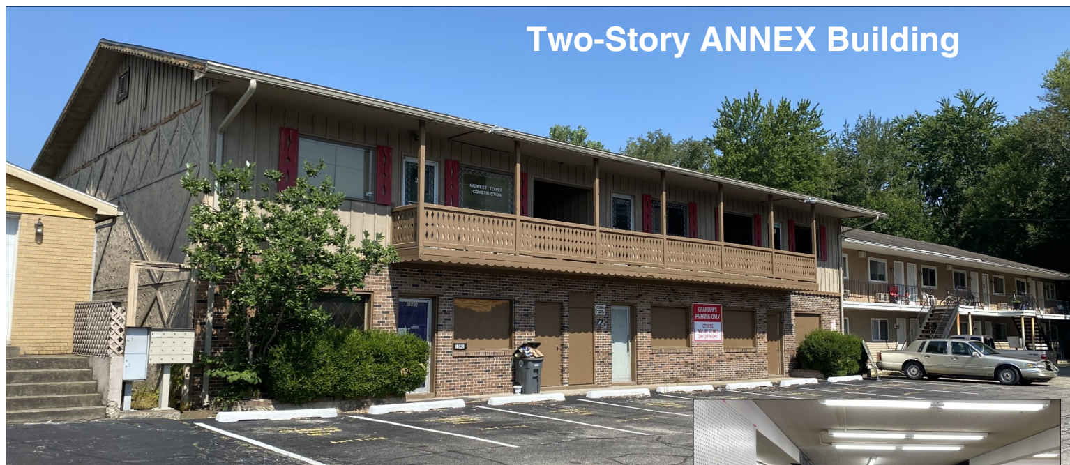
Two-Story ANNEX Building