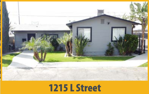
1215 L Street