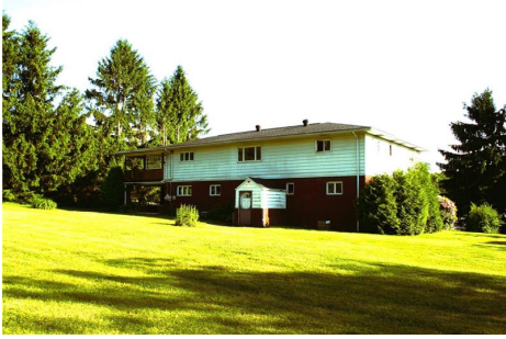
Back of Structure