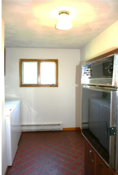
Other - Pantry/Office 1st Floor Apartment