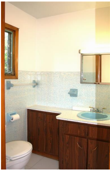
Bathroom - master bath