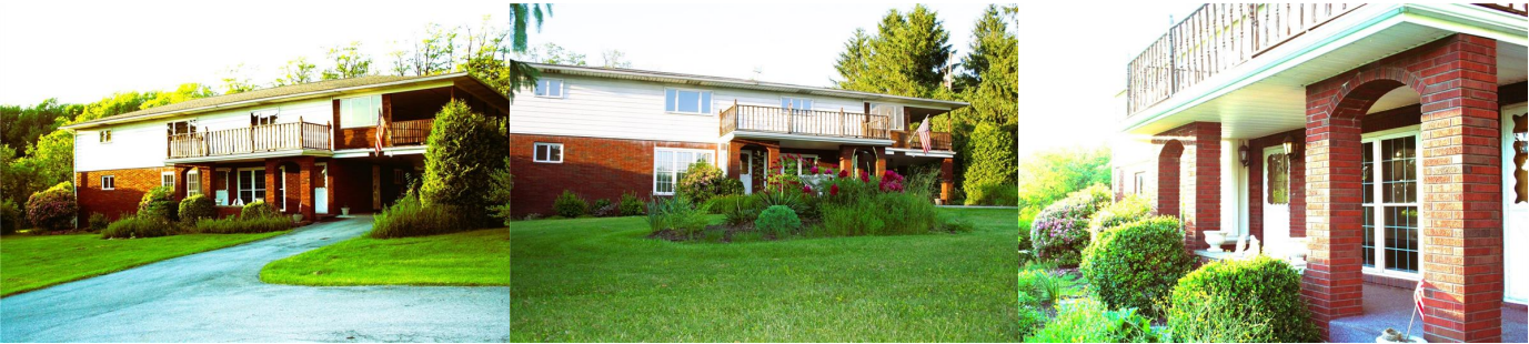
Front of Structure