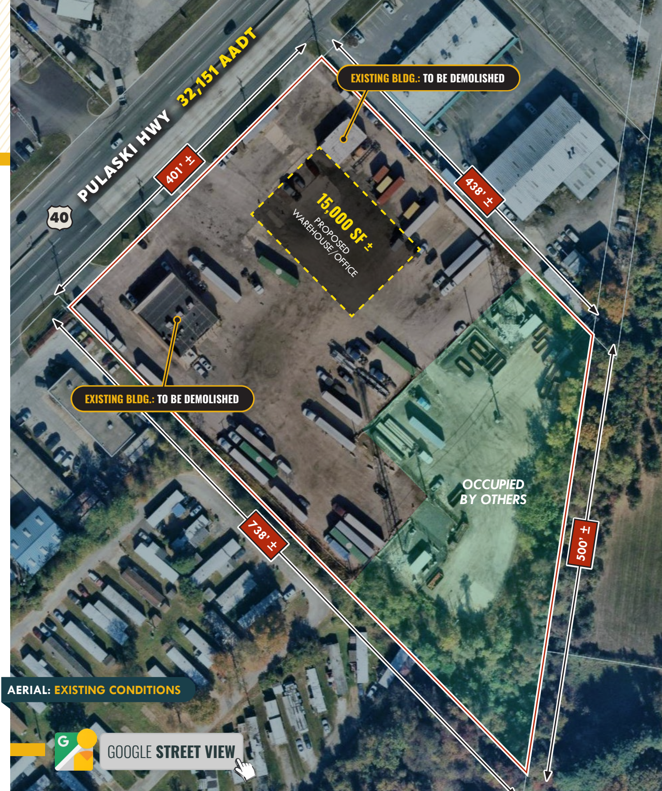
AERIAL: EXISTING CONDITIONS