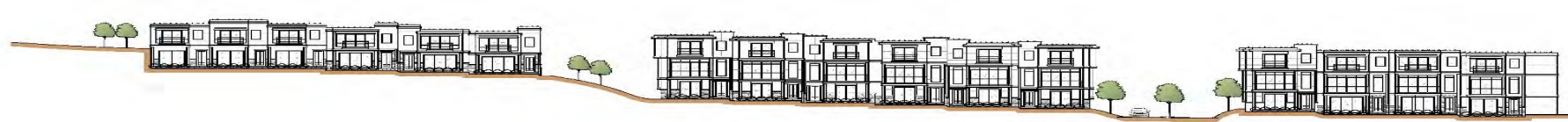
1 STREET ELEVATION 1/16"=1'-0"