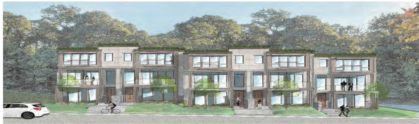
3 ONE-POINT PERSPECTIVE NTS