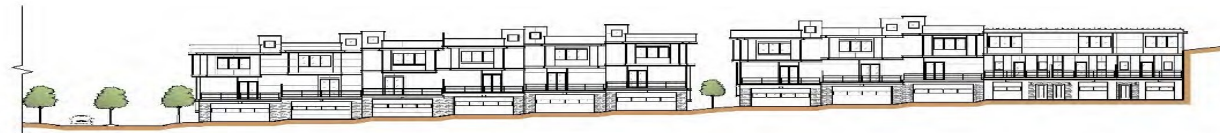
2 REAR ELEVATION 1/16"=1'-0"