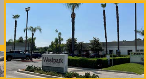
5251 Office Park Drive

5251 Office Park Drive - Bakersfield, CA